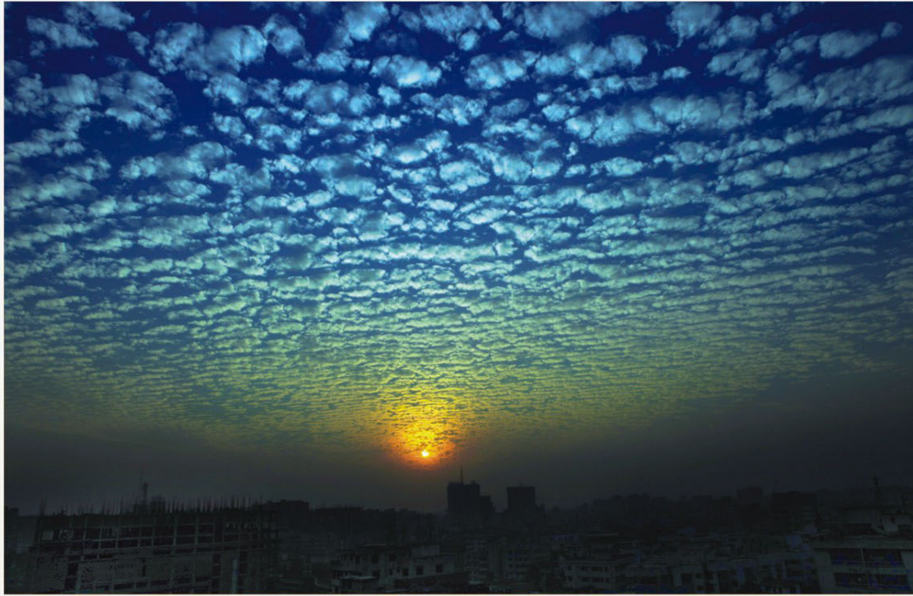
A shot of yesterday's beautiful winter afternoon sky in Dhaka, hardly noticed in the din and bustle of the concrete jungle.