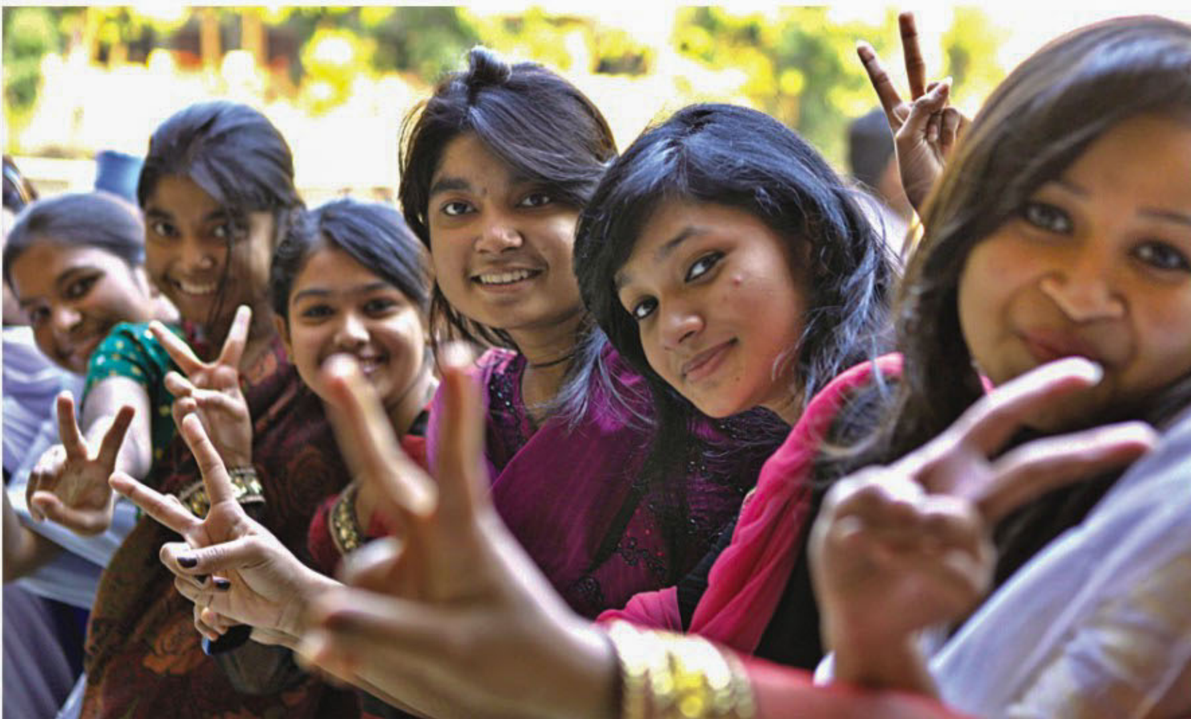
Jubilant class-VIII students of Ideal School and College, Motijheel, celebrate as the results of JSC examinations published yesterday rated the school the best in Dhaka Board. More on page 2.