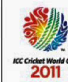
MASHRAFE BIN MORTAZA

Mashrafe Bin Mortaza is all about heart, courage and his never-say-die attitude. When he talked to this reporter at the Sher-e-Bangla National Stadium yesterday, the man dubbed the Narail Express spoke of his desire and determination to play a part in the Bangladesh team for the ICC 2011 World Cup.