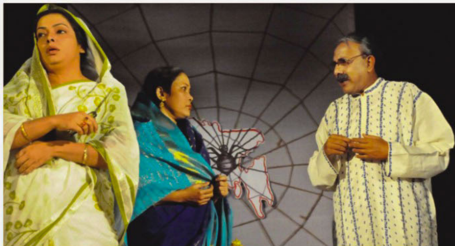
Fourteen theatre groups from Dhaka, Barisal and Jhalakathi staged 15 plays at Barisal Ashwini Kumar Hall and Shabdaboli Studio Theatre.

Group theatre teams from Barisal that took part in the festival were: Shabdaboli Group Theatre with "Fona" and "Neel Moyurer Joubon", Kheyali Group Theatre with "Nodi Mayer Moto", Barisal Natak with "Pagoitihasik", Brojomohan Theatre with "Ei Deshey Ei Beshey", Barisal Shishu Theatre with "Bolta" and Natyam with "Shylock and