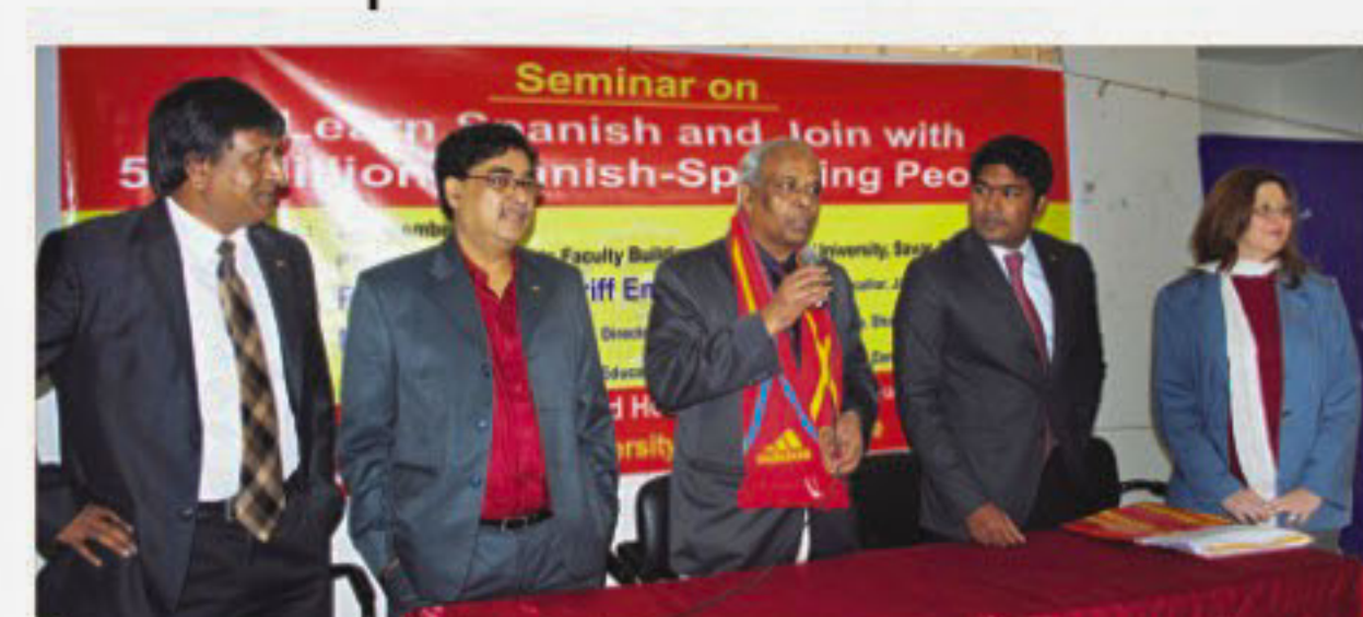
Discussants at the seminar.

A seminar titled, 'Learn Spanish and join 500 million Spanish speaking people' was held at the New Arts Faculty, Jahangirnagar University (JU) on December 28. JU Centre for Language Learning organised the seminar, according to a press release.