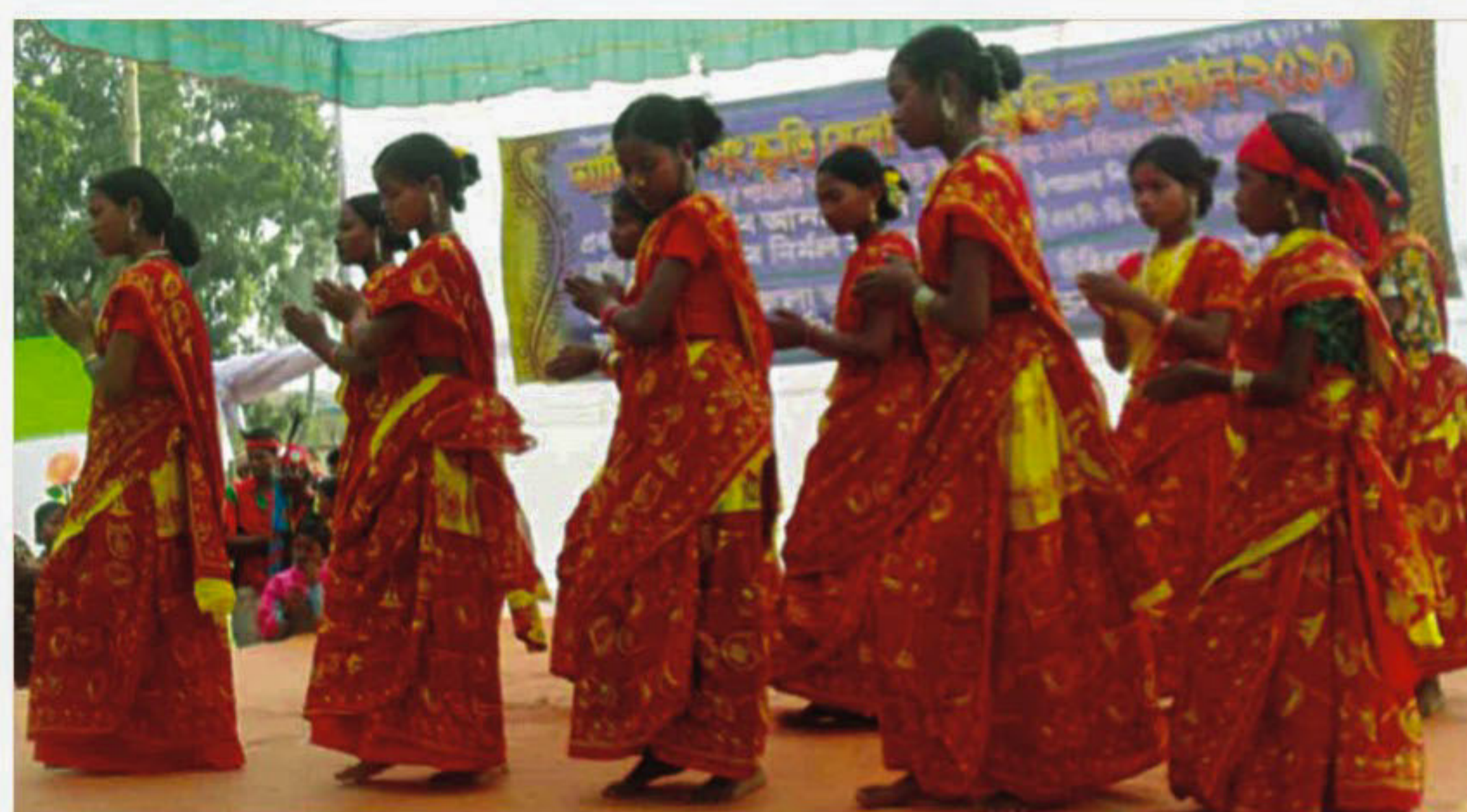
Indigenous performers during a dance at the programme.