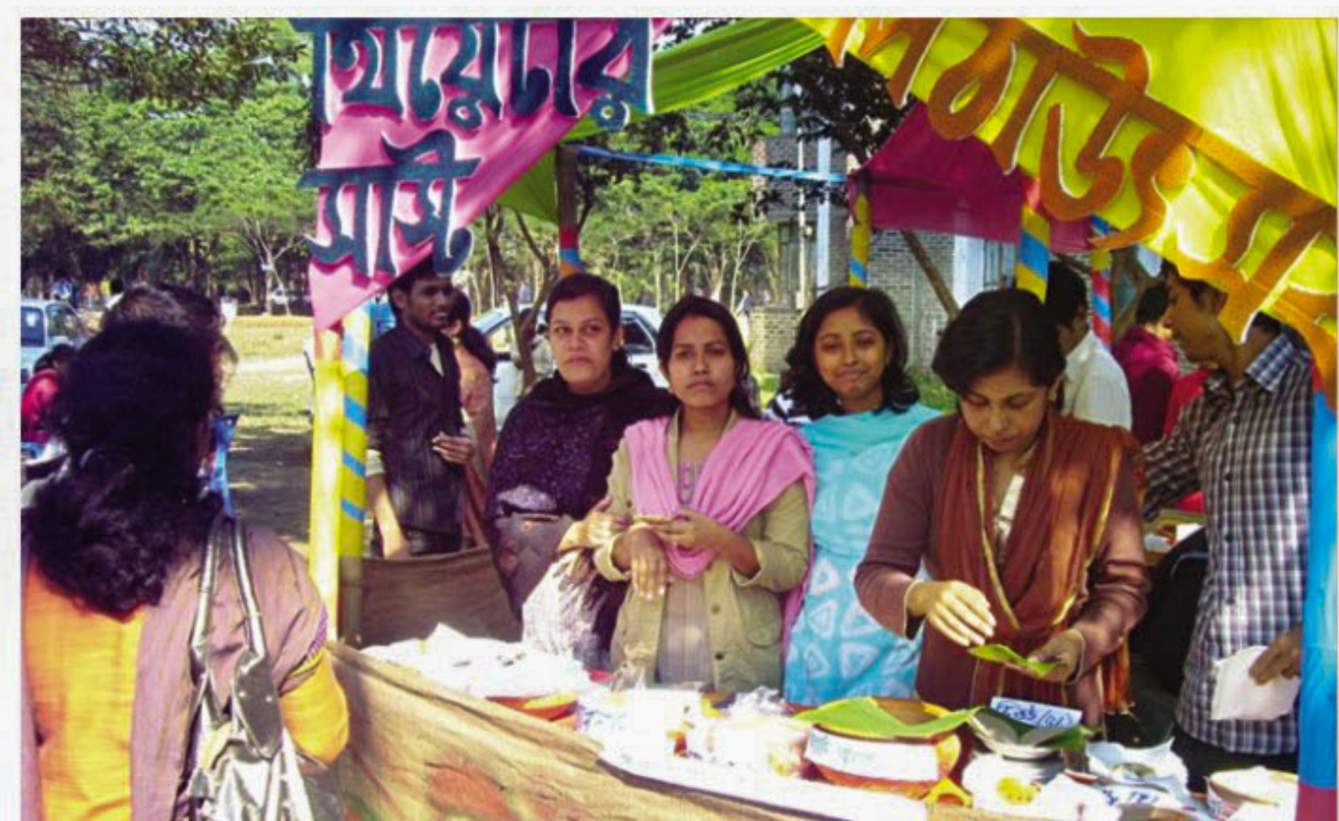
Every winter, a 'pitha utshab' is held at SUST to preserve the tradition of rice cakes in the country.