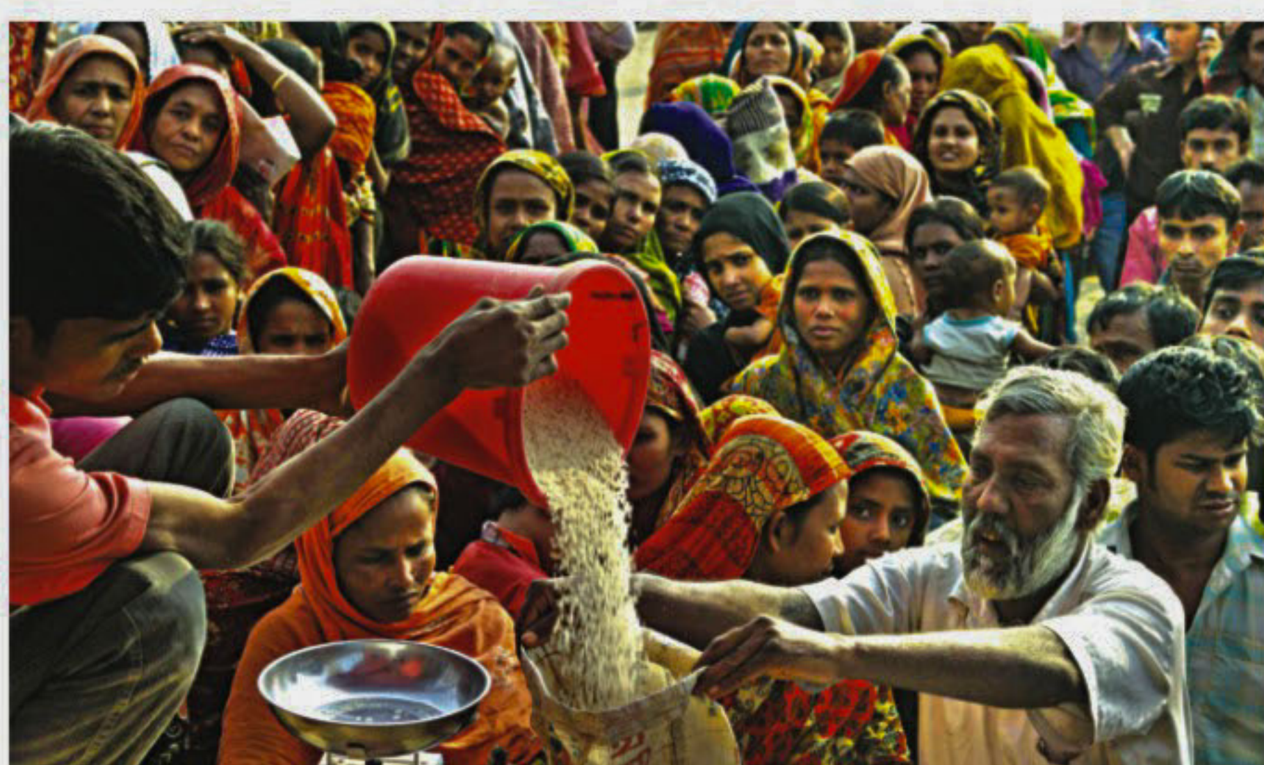
Queue of people waiting to collect rice at Tk 24 per kg from an open market sale (OMS) point at Kamrangirchar in the city yesterday.

Razzak is the father of Momin, an 18-year-old college student who was killed by criminals in 2005.