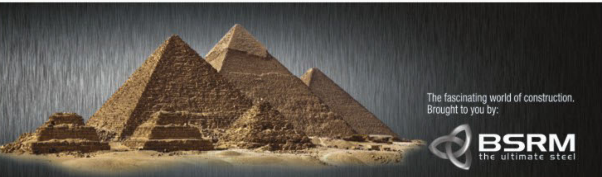
The fascinating world of construction. Brought to you by: BSRM the ultimate steel

It is believed the pyramid was built as a tomb for Fourth dynasty Egyptian pharaoh Khufu and constructed over a 14 to 20 year period. The Great Pyramid was originally 280 Egyptian cubits tall, 146,478 metres (480.57 ft). Each base side was 440 royal cubits, 230.37 metres (755.81 ft) in length.