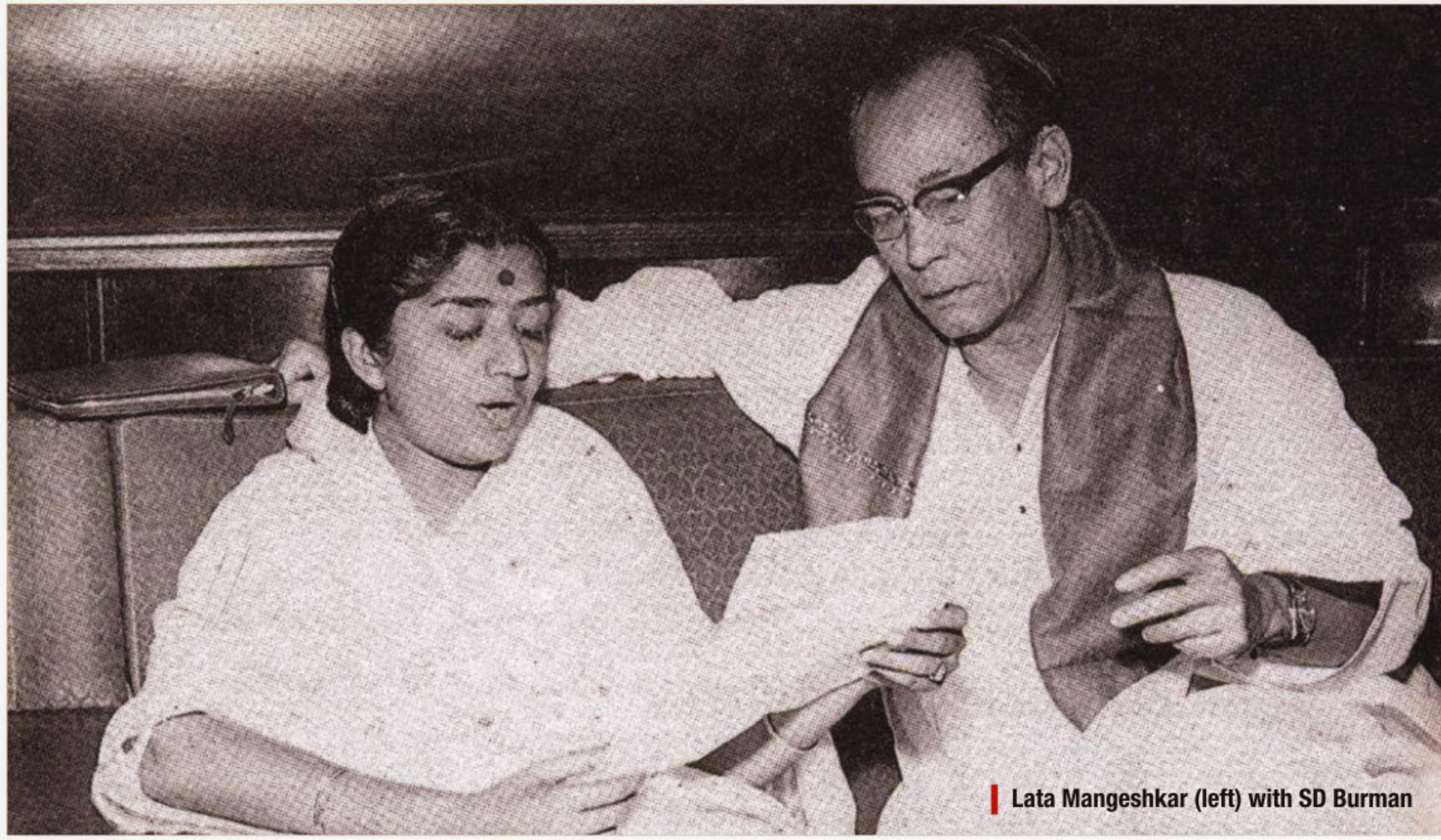
Lata Mangeshkar (left) with SD Burman

Today on HBO at 8:15 am Language: English Genre: Romance/Comedy Storyline: Brad (Vince Vaughn) and Kate (Reese Witherspoon) have been in a relationship for three years. They are very much in love and have the time of their lives with no intention of getting married or having kids. On Christmas day, the two of them visit their parents -- both sets divorced. That will make it four Christmas visits in all. Brad and Kate learn a lot more about each other throughout the day. Directed by: Seth Gordon