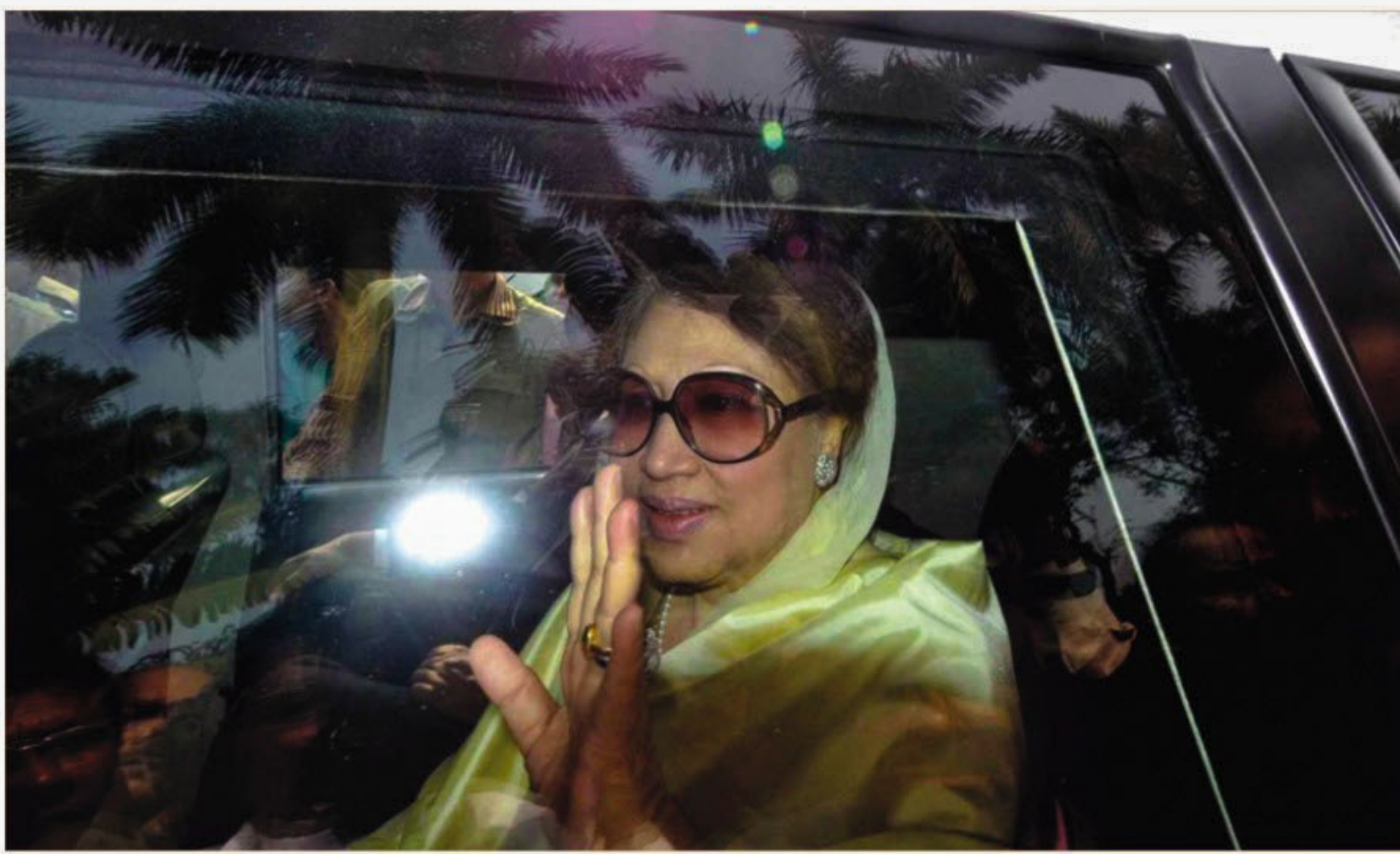
Leader of the Opposition in Parliament and BNP Chairperson Khaleda Zia waves to party leaders and activists at Hazrat Shahjalal International Airport yesterday on her return from China after a five-day visit. (Story on Page 1)