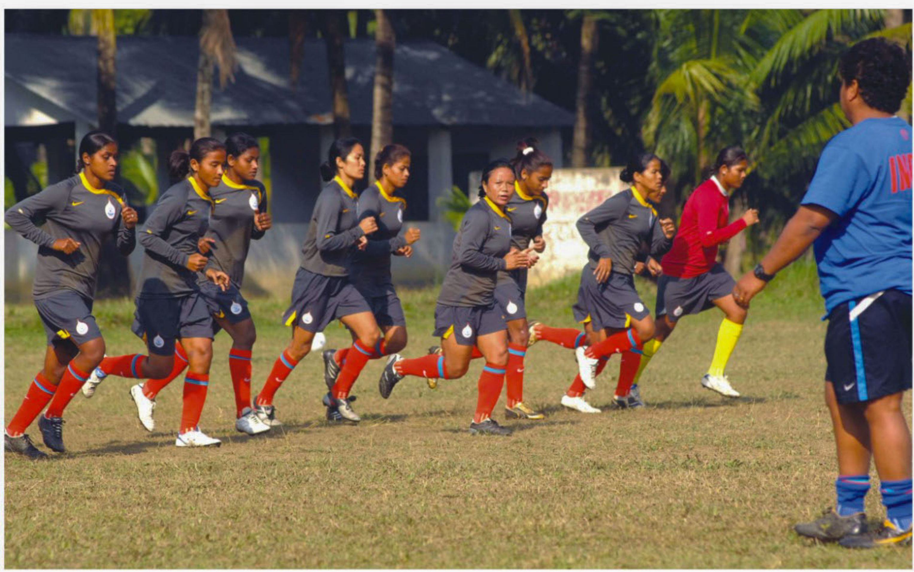
India players do the hard yards during practice on Wednesday, ahead of today's final of the SAFF Women's Football Championship against Nepal in Cox's Bazar.

In the day's other match, Brothers (228 all out) beat Baridhara Dazzlers (173-9) by 55 runs at the new BKSP ground.