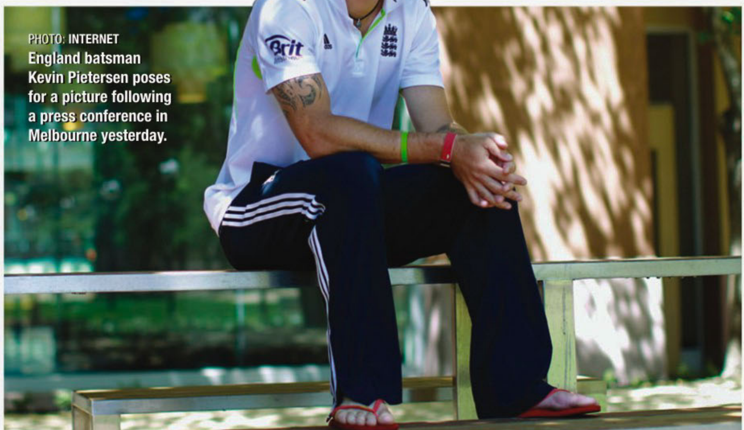
England batsman Kevin Pietersen poses for a picture following a press conference in Melbourne yesterday.