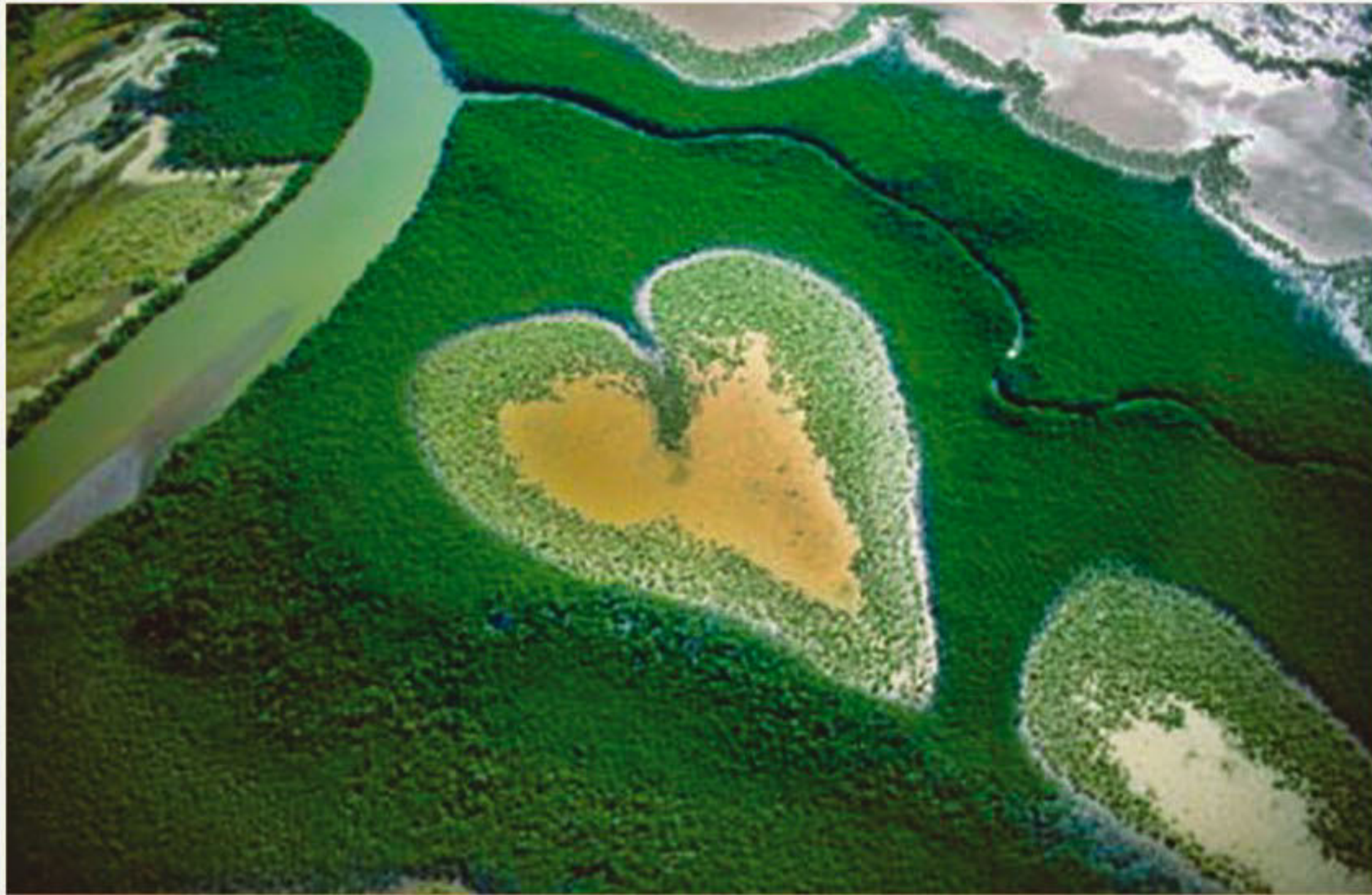
The photographs reflect the variety of natural habitats and expressions of life, and also the human imprint and assault on the earth.

To generate awareness on environmentalism among Bangladeshis,