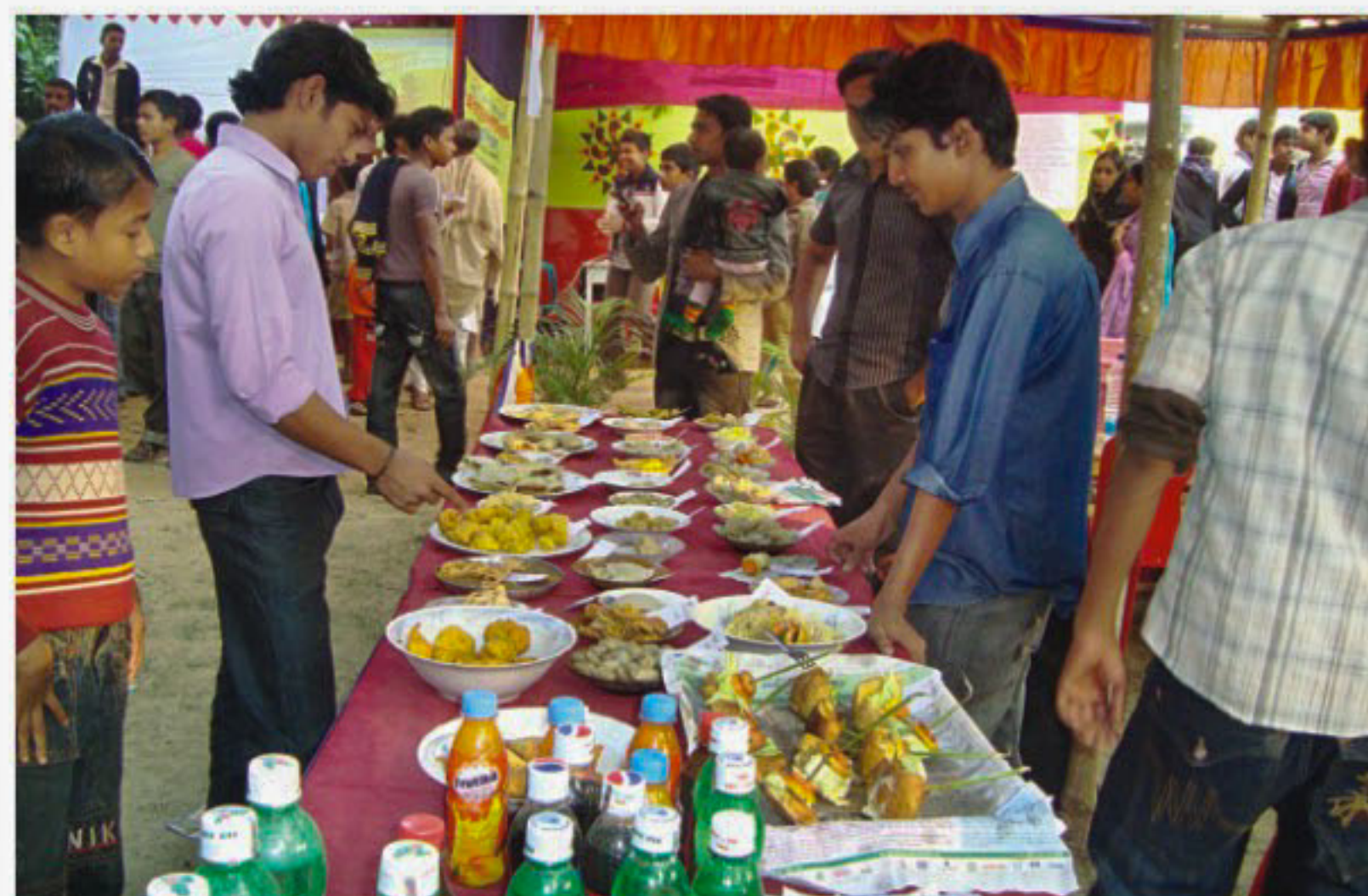
Keen foodies at the fair.