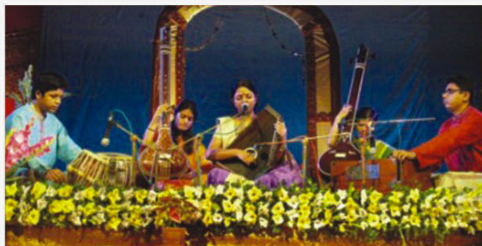
A performance at last year's festival.