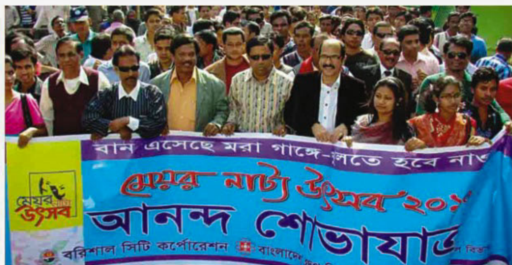
A rally was brought out to mark the opening of the festival.