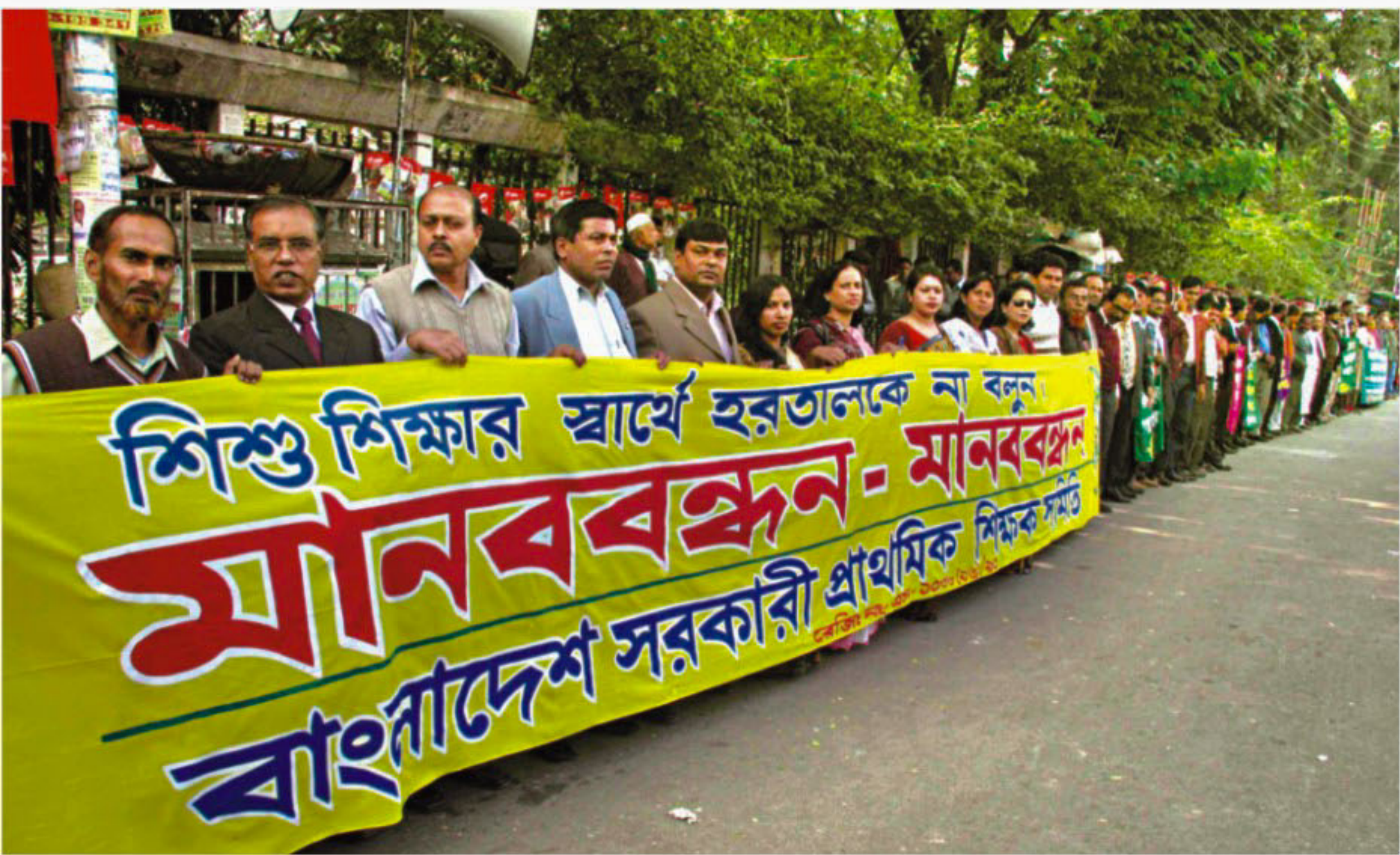
Bangladesh Primary School Teachers' Association forms a human chain in front of the National Press Club in the city yesterday with the slogan "Say no to hartal for the sake of child education".