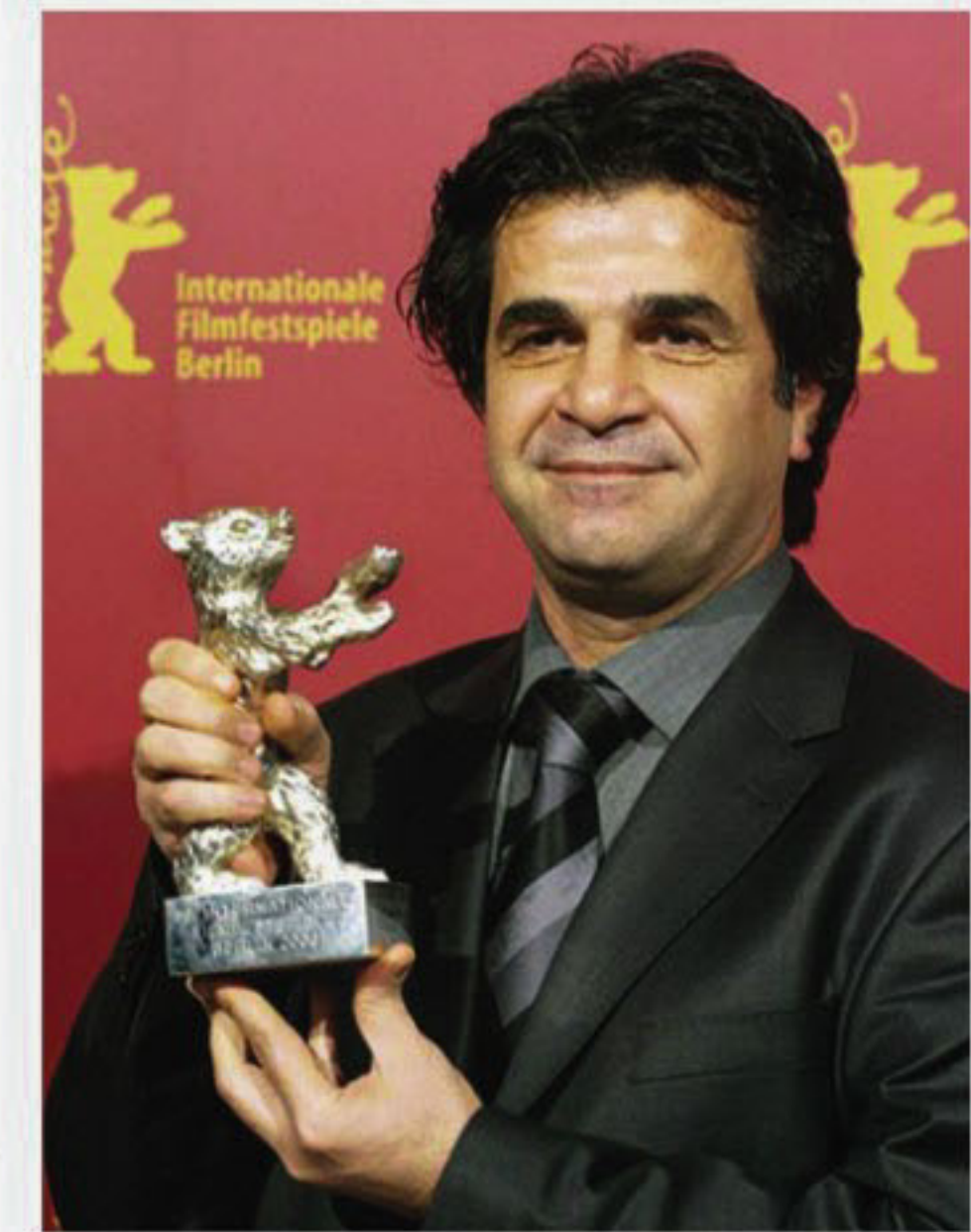
Jafar Panahi poses with his Silver Berlin Bear for his film "Offside" at the 56th Berlinale International Film Festival in 2006.