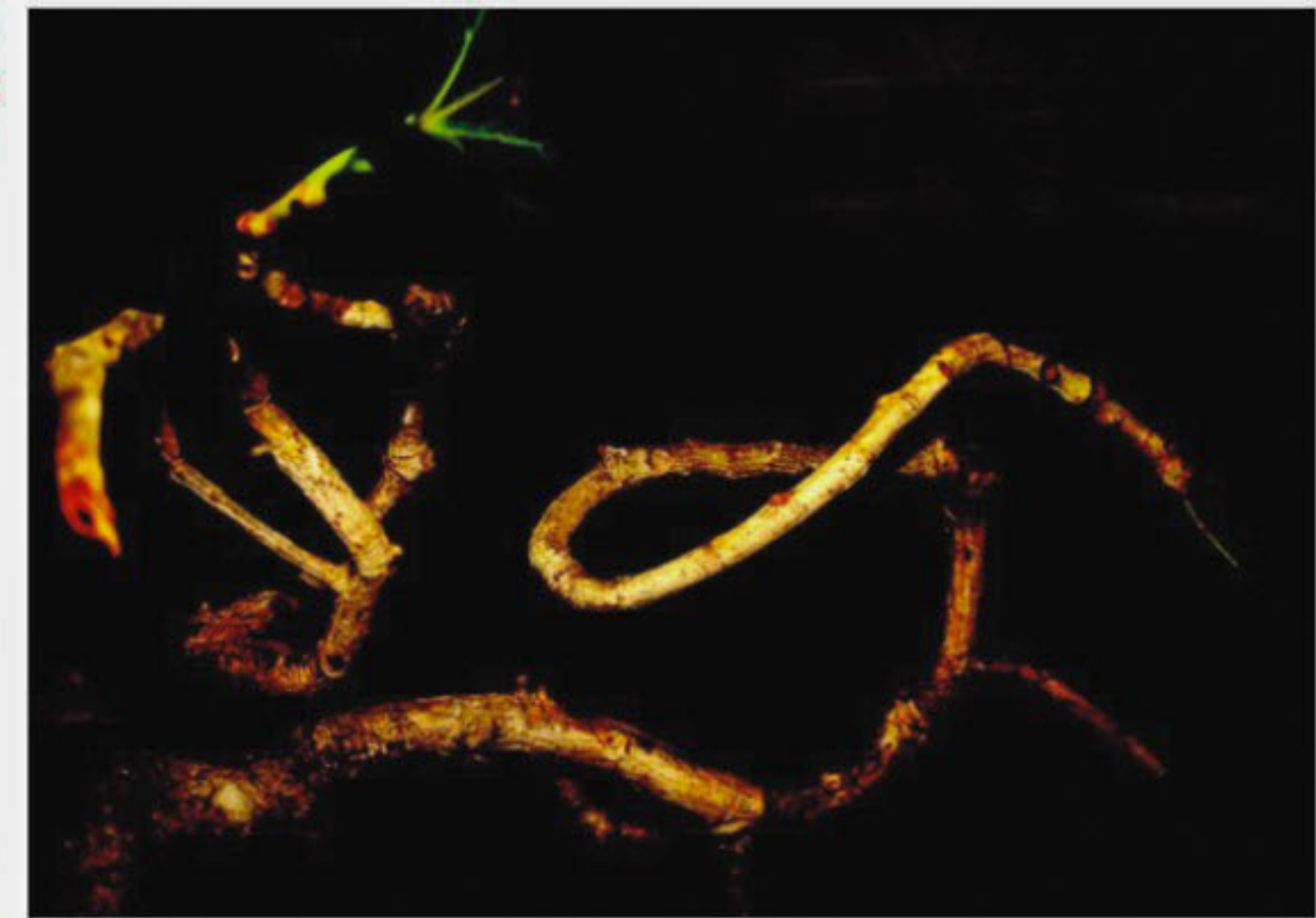
Shape of Dream-2

The photographs titled "Innocence" show the setting and emerging sun in the background with flowers at the centre. Ray of light is a noticeable feature in the photograph. Lovely often zooms in on a