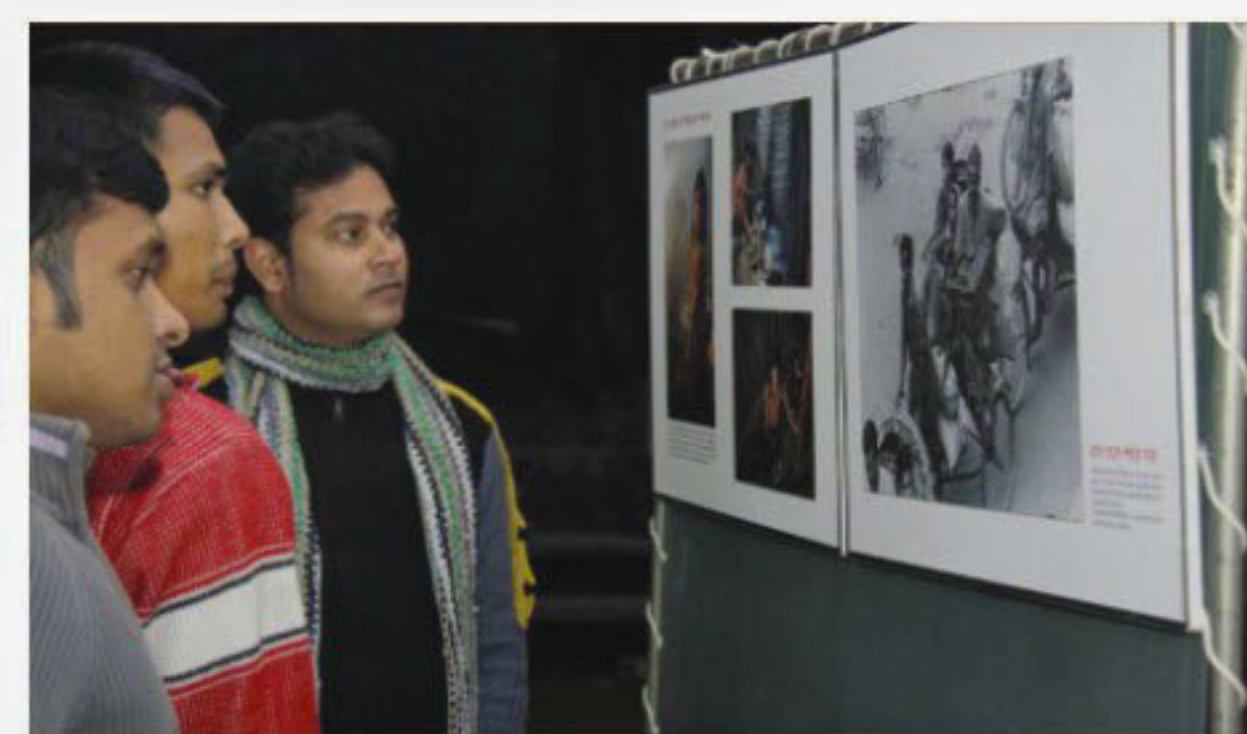
Visitors at the exhibition.