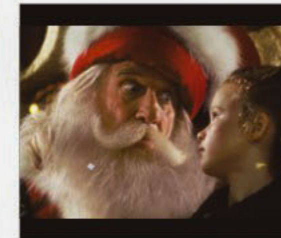
All I Want For Christmas On HBO at 10:30pm Genre: Comedy Cast: Leslie Nielsen, Jamey Sheridan, Ethan Randall