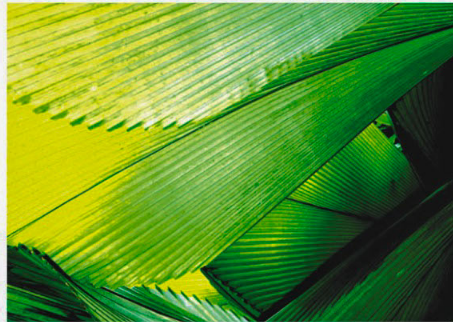
Shape of Dream-1

Lovely's solo photo exhibition at Zainul Gallery