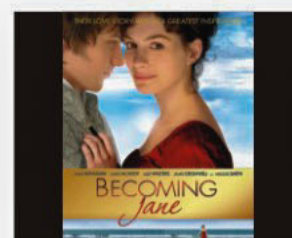
Becoming Jane On Zee Studio at 9:30pm Genre: Romance Cast: Anne Hathaway, James McAvoy