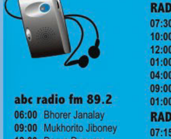
RADIO FOORTI 07:30 Hello Dhaka 10:00 Morning Express 12:00 My Time 01:00 No Tension 04:00 Dhaka Calling 09:00 Night Rider 01:00 Back to Back music RADIO TODAY 07:15 Good Morning Dhaka 11:00 Must Unlimited 01:00 Today's Adda 04:00 U Turn 08:00 Tobey Tai Hok 11:00 Raat Bhor Gaan 12:00 Today's Happy Moments