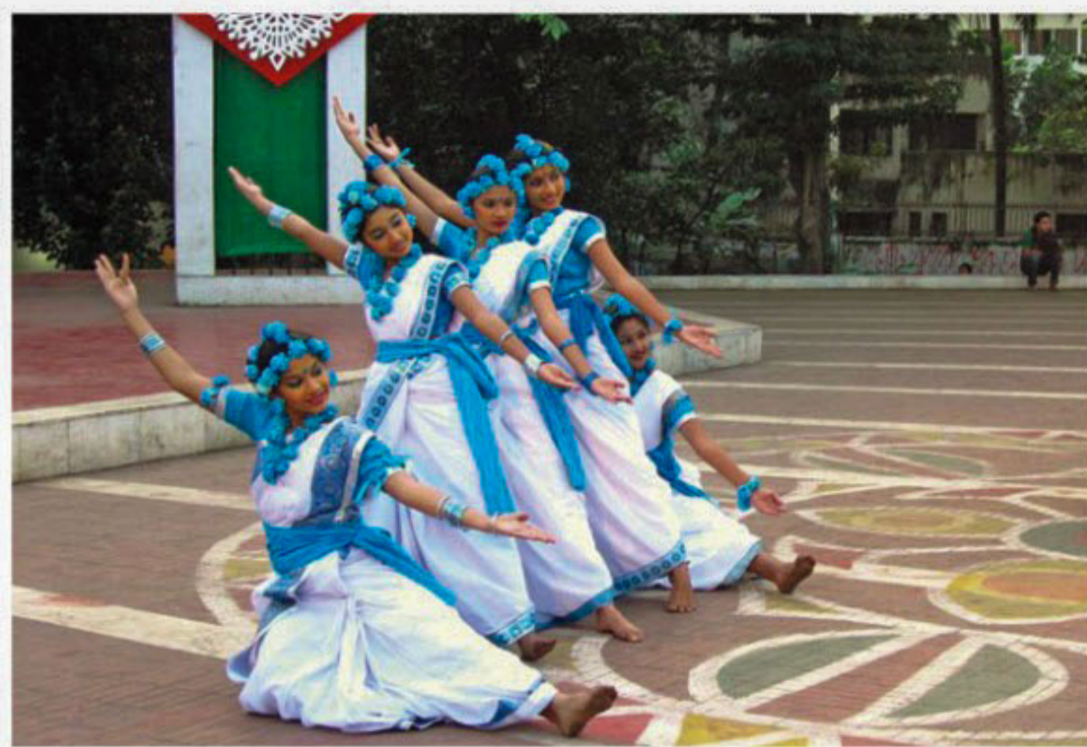
A group dance performance at Shaheed Minar.