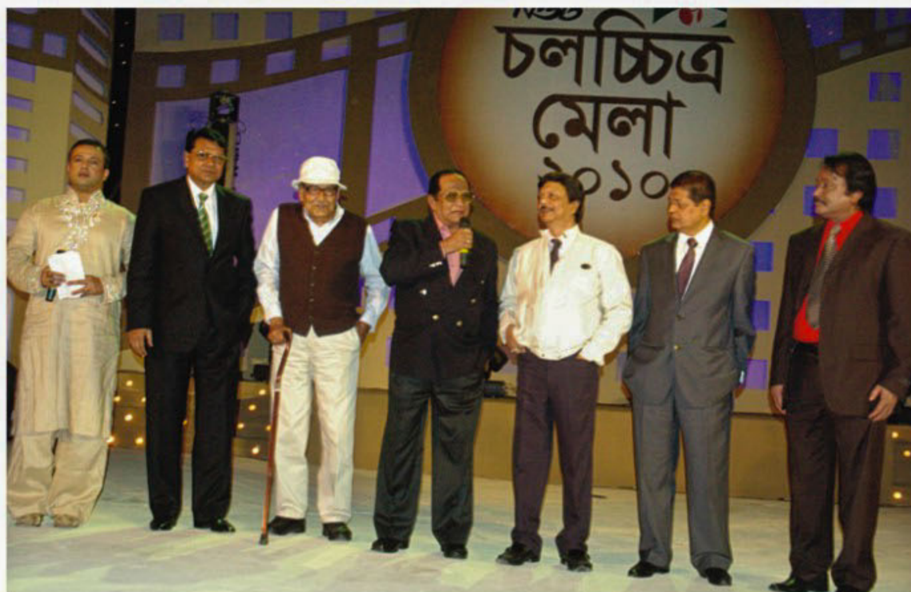
Veteran film actors were honoured at the event.