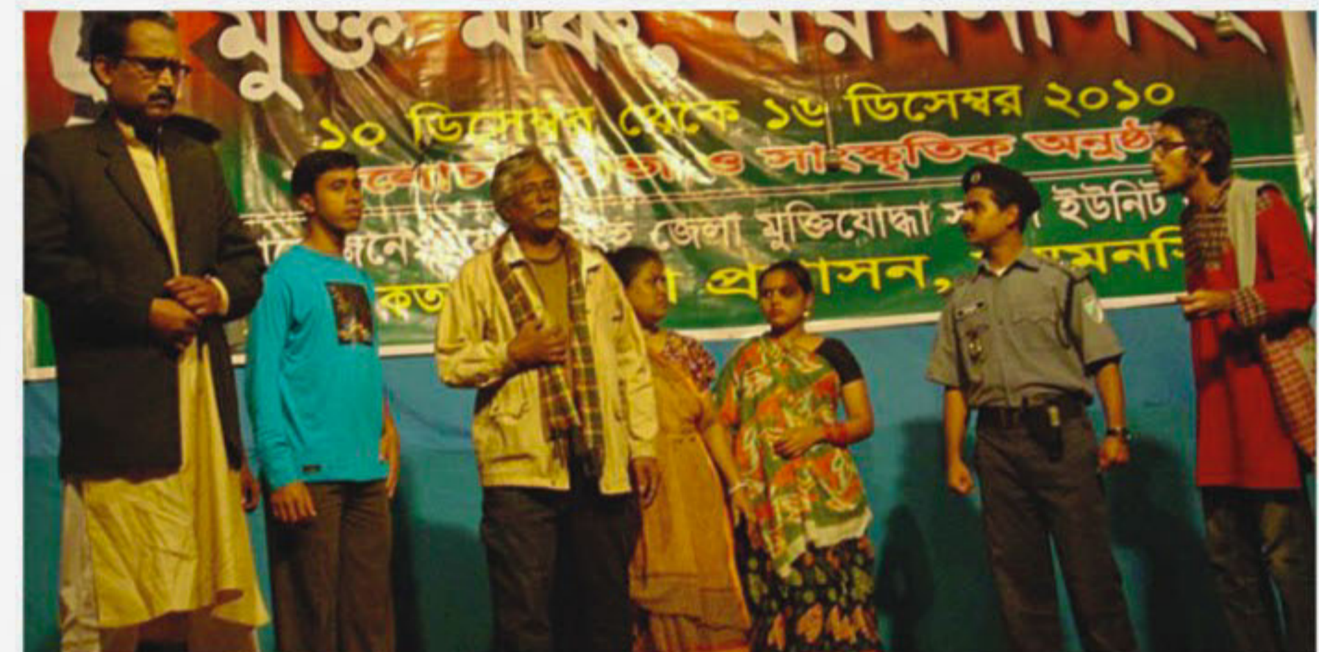
Actors of Natyangan Natya Paribar in the play "Unmochan".

The speakers were of the view that it is imperative to keep a sharp vigil over the dark forces who opposed the Liberation War in 1971.