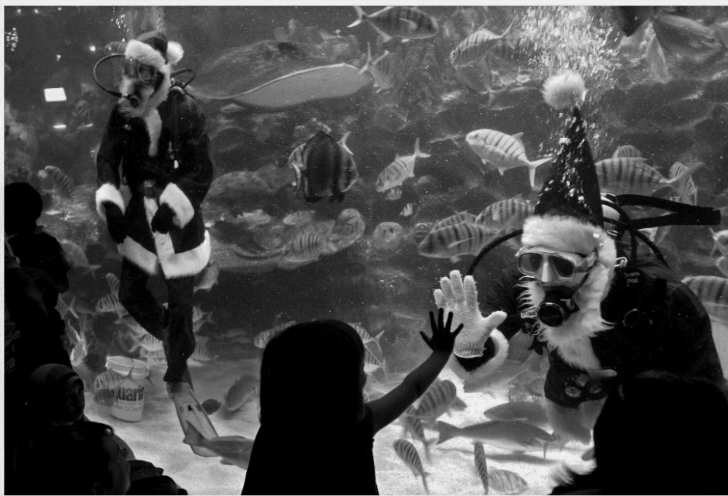
A diver dressed as Santa Claus, or Father Christmas, high-fives a visiting girl at an aquarium during a show at Aquaria KLCC underwater park in Kuala Lumpur yesterday.