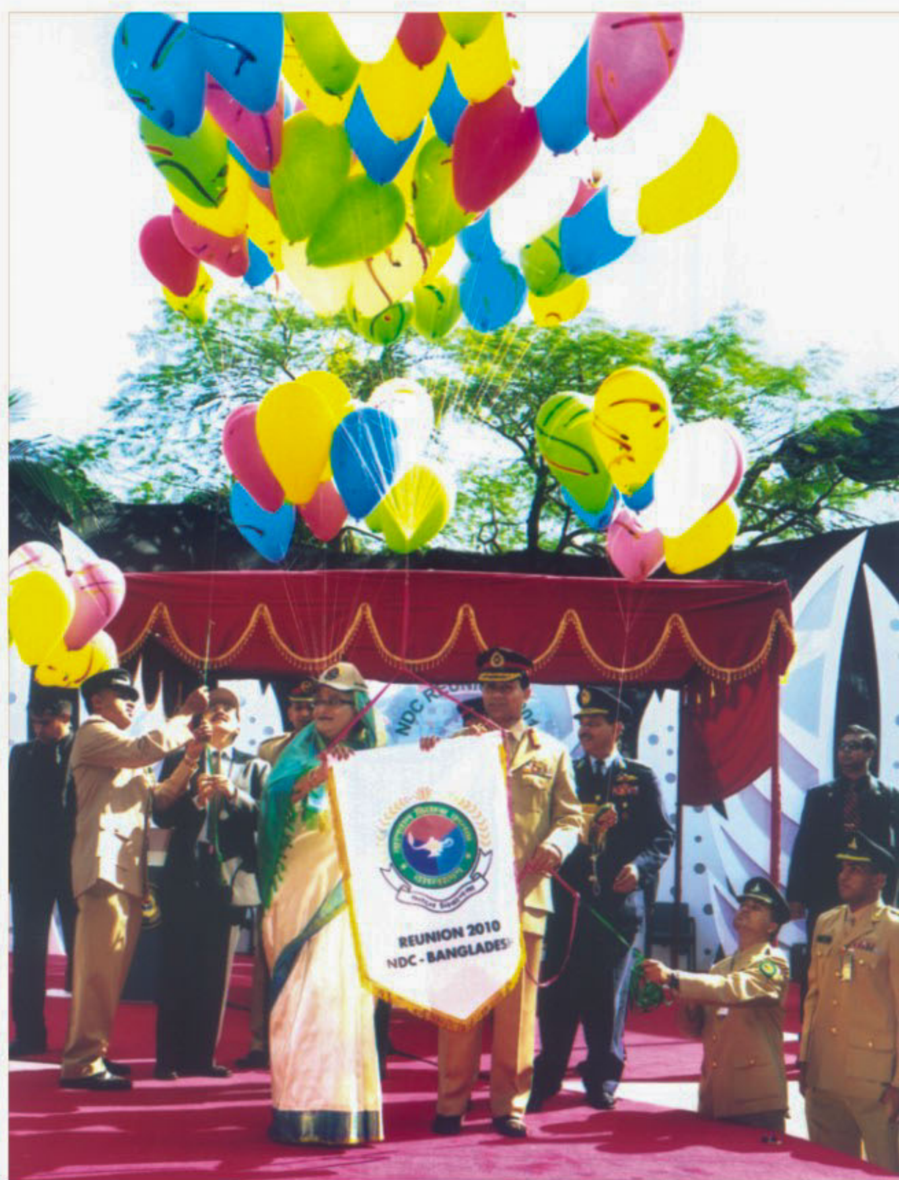
Prime Minister Sheikh Hasina inaugurates the first reunion of National Defence College by releasing balloons in the sky on NDC premises of Mirpur Cantonment in the city yesterday.

The leaders demanded immediate arrest and punishment of the accused otherwise, they said, the universal rights of the physically challenged people will not be ensured in the country.