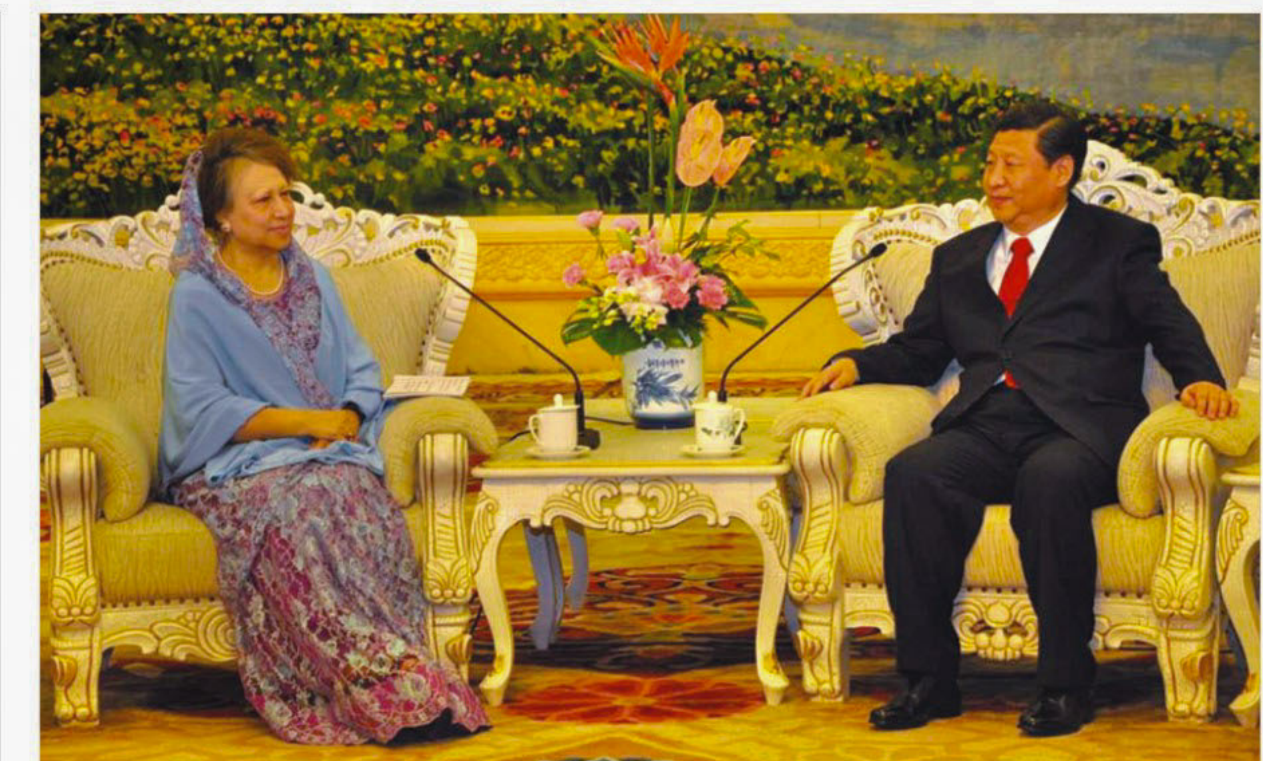
Leader of the Opposition in Parliament and BNP Chairperson Khaleda Zia calls on Chinese Vice President Xi Jinping at China's Great Hall in Beijing yesterday.