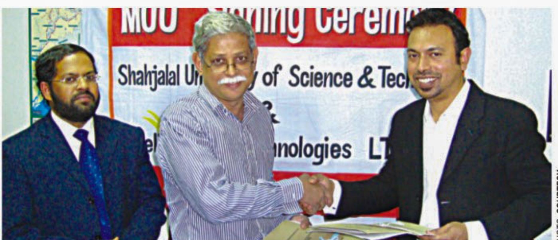
Shahjalal University of Science and Technology (SUST) and ReliSource Technologies Ltd sign a deal at SUST yesterday.