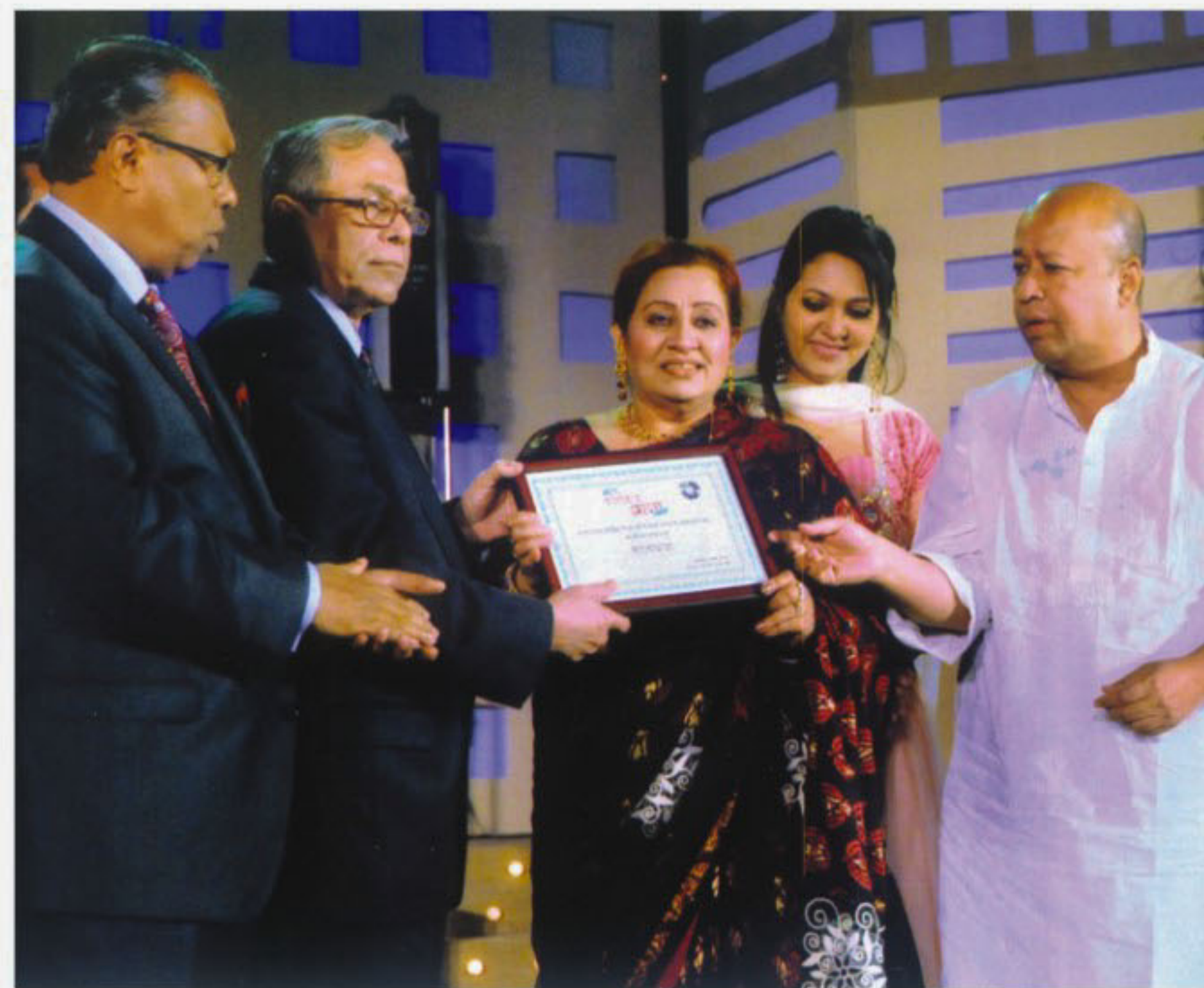
Jatiya Sangsad Speaker Md Abdul Hamid Advocate hands over lifetime achievement award to actress Anwara at Cute-Channel i Film Festival held at Bangabandhu International Conference Centre in the city yesterday.