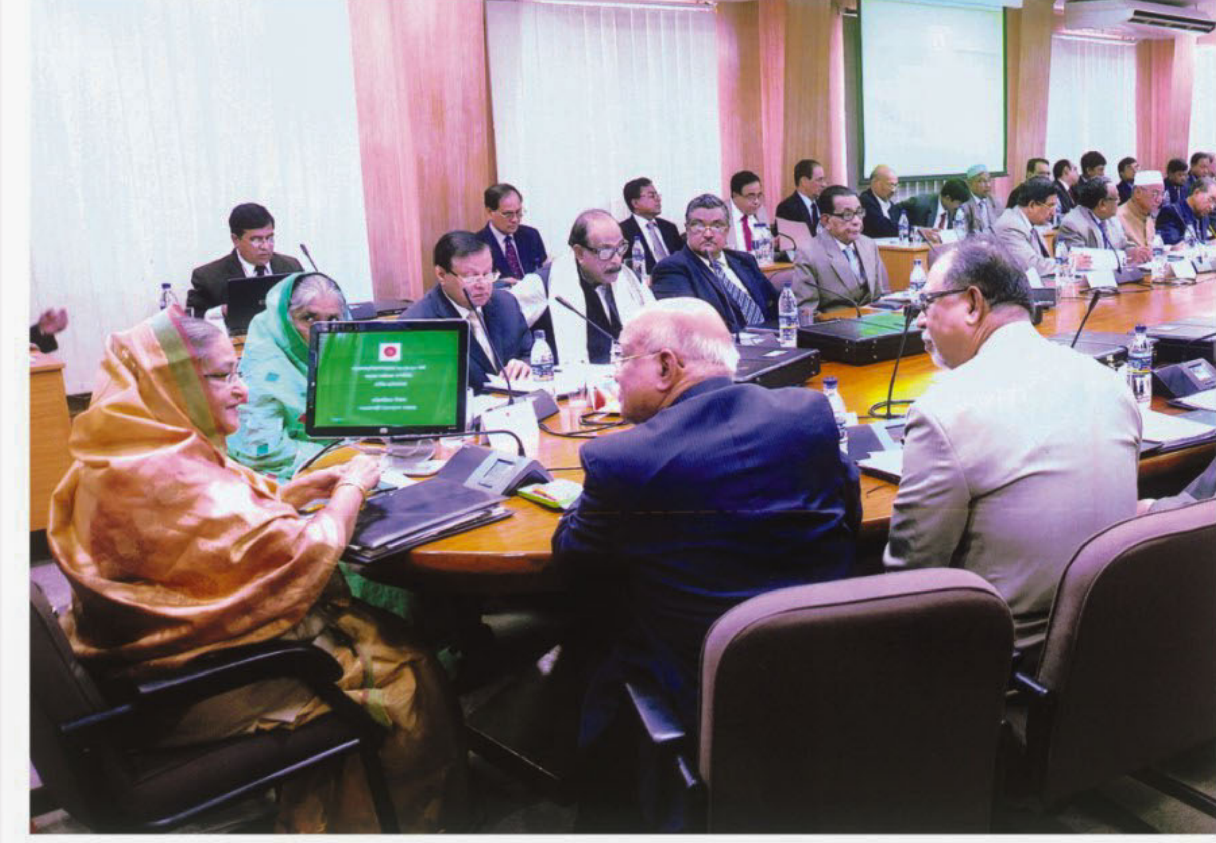
Prime Minister Sheikh Hasina presides over a meeting of the council of ministers at Bangladesh Secretariat in the city yesterday. (Story on Page 1)