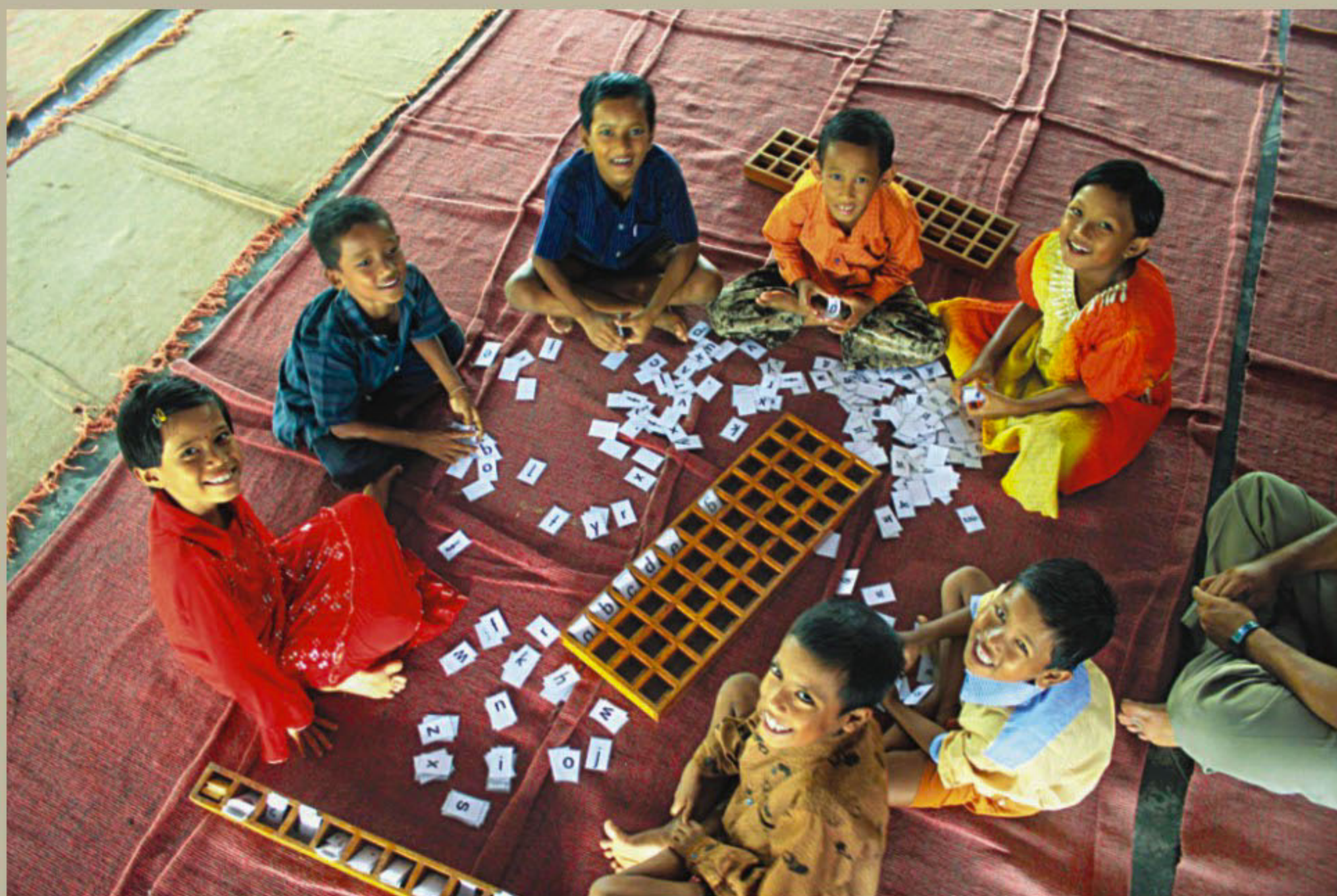
LITON RAHMAN / DRINKNEWS