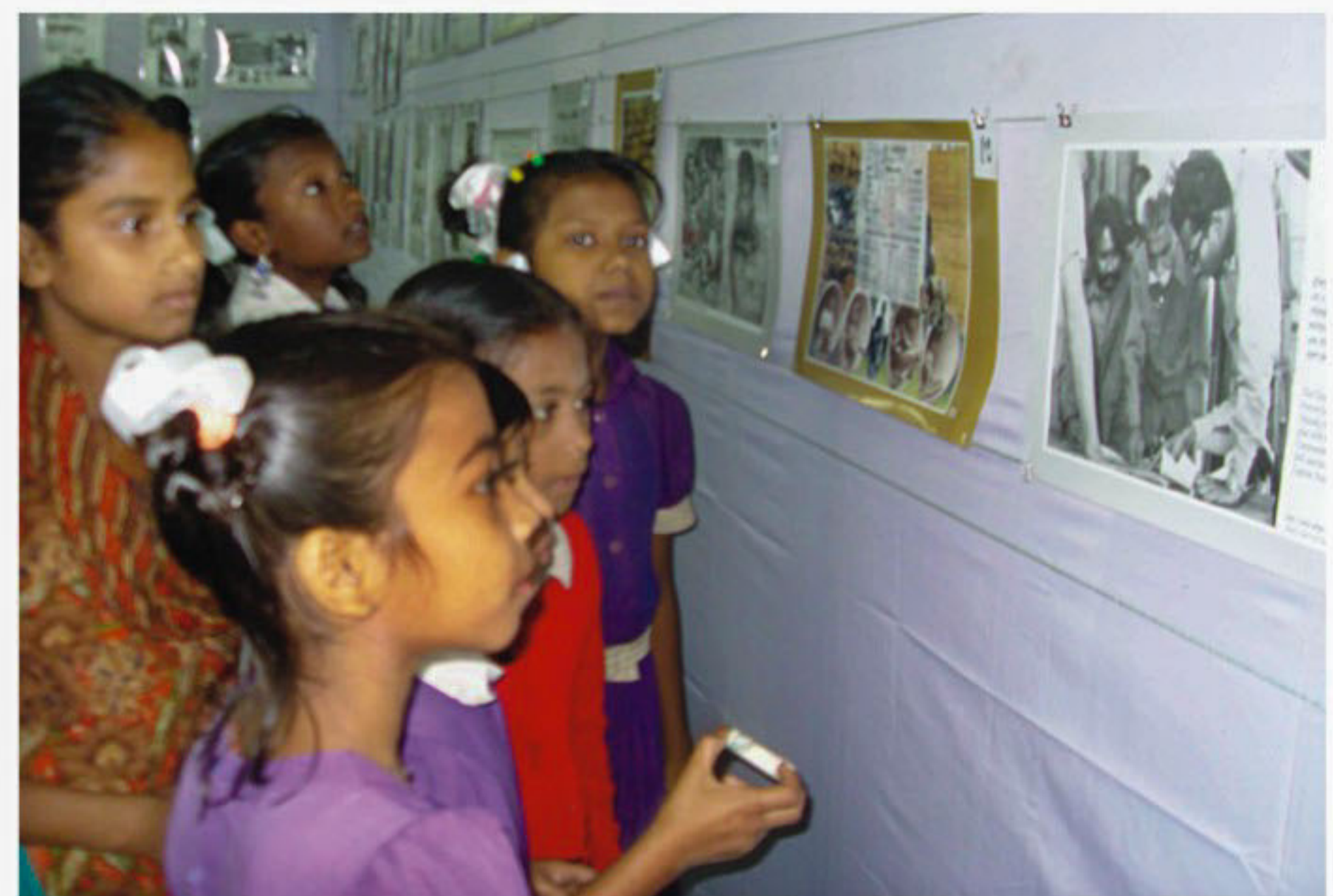
Visitors, mostly students at the display.