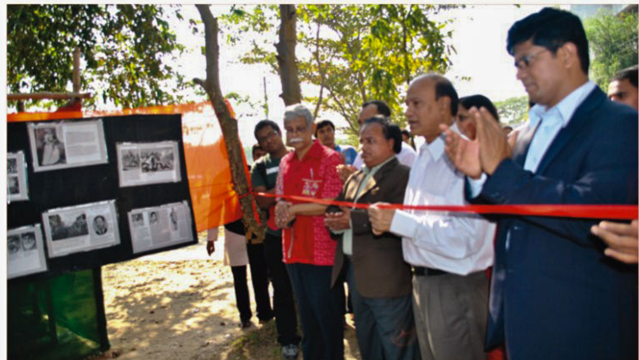
Eminent personalities at the exhibition inaugural.

The photographs unravel from the stone inscriptions of Aryan era, to relics of Mohasthangar, Battle of Plassey, on to images of Ishwar Chandra Bidyasagar, Begum Rokeya and the movements against colonial rule. The exhibits then go on to the developments of 1952, 1966, 1969, 1971, George Harrison's concert, Indira Gandhi, and the surrender of General Niazi to