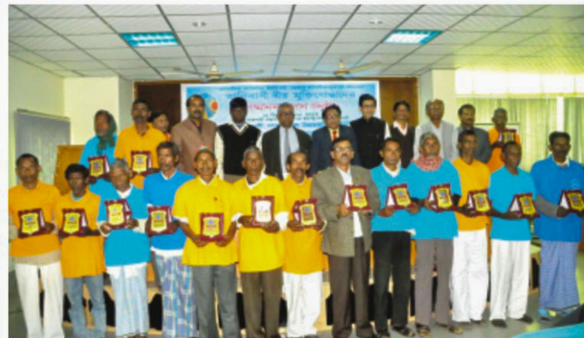
Indigenous freedom fighters honoured with crests at the programme.