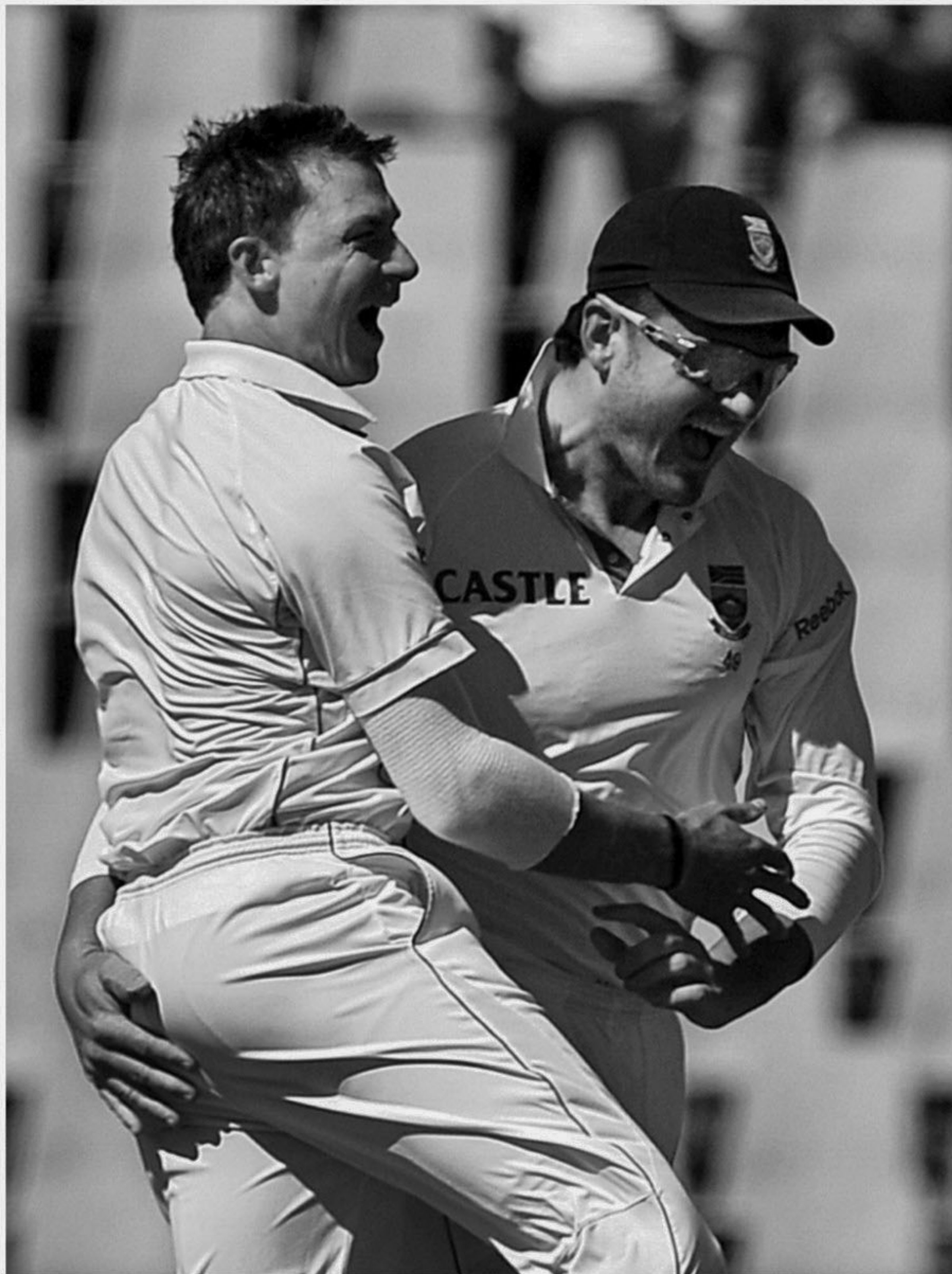
South Africa speedster Dale Steyn (L) celebrates with captain Graeme Smith after snaring India opener Virender Sehwag for a duck during the first day of the first Test at SuperSport Park in Centurion yesterday.

Result: Shaheed Jewel XI won by four wickets.