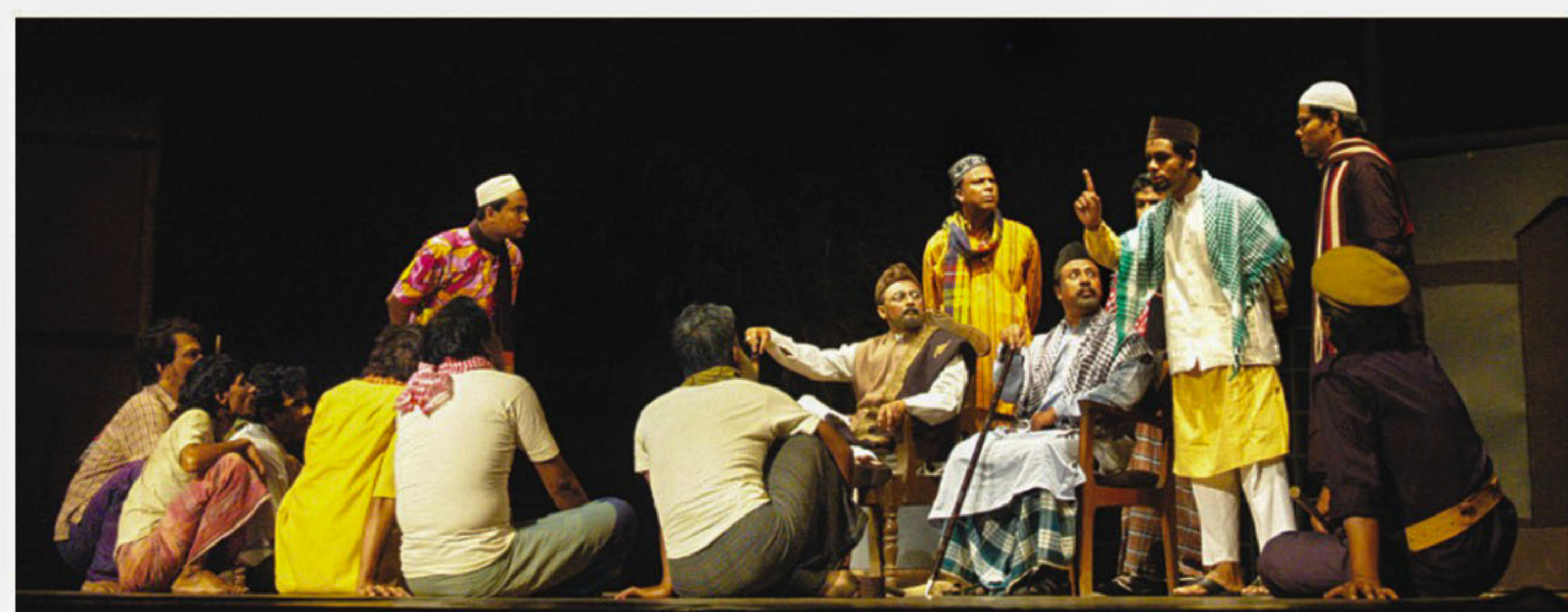
A scene from the BSA production "Khetmajur Khaimuddin".