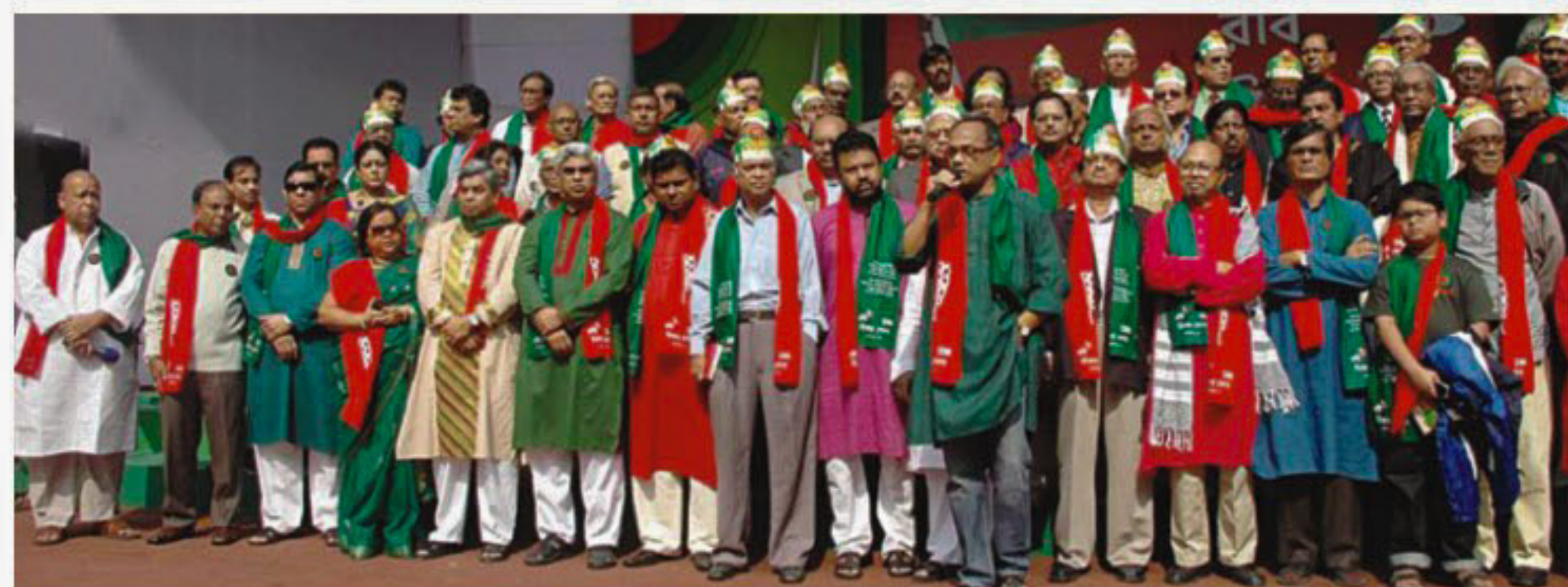
Noted personalities at the programme.

Channel i honoured several organisations at the programme.