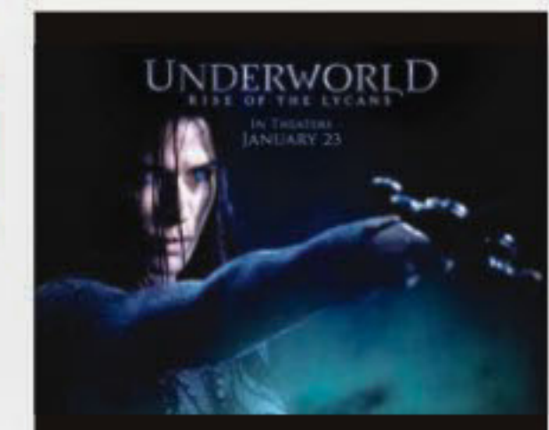
Underworld: The Rise Of The Lycans On HBO at 11pm Genre: Action Cast: Bill Nighy, Rhona Mitra