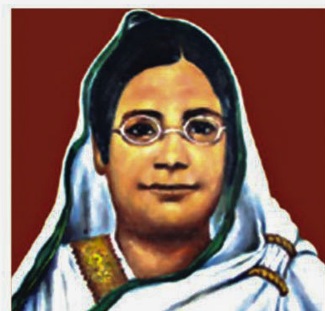
A portrait of Begum Rokeya.