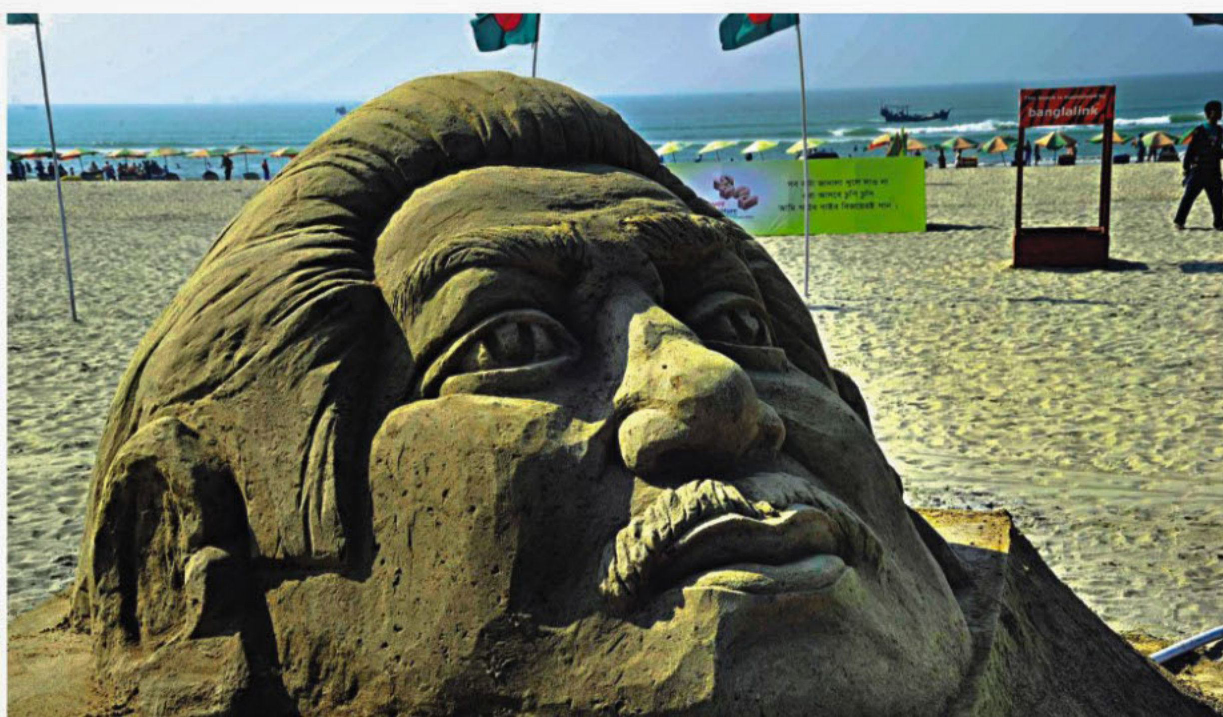
A sand sculpture of Birshrestha Sepoy Hamidur Rahman on the Cox's Bazar beach. Teachers and students of the Institute of Fine Arts, Dhaka University, built the sculpture as tribute to the martyr on the eve of Victory Day.