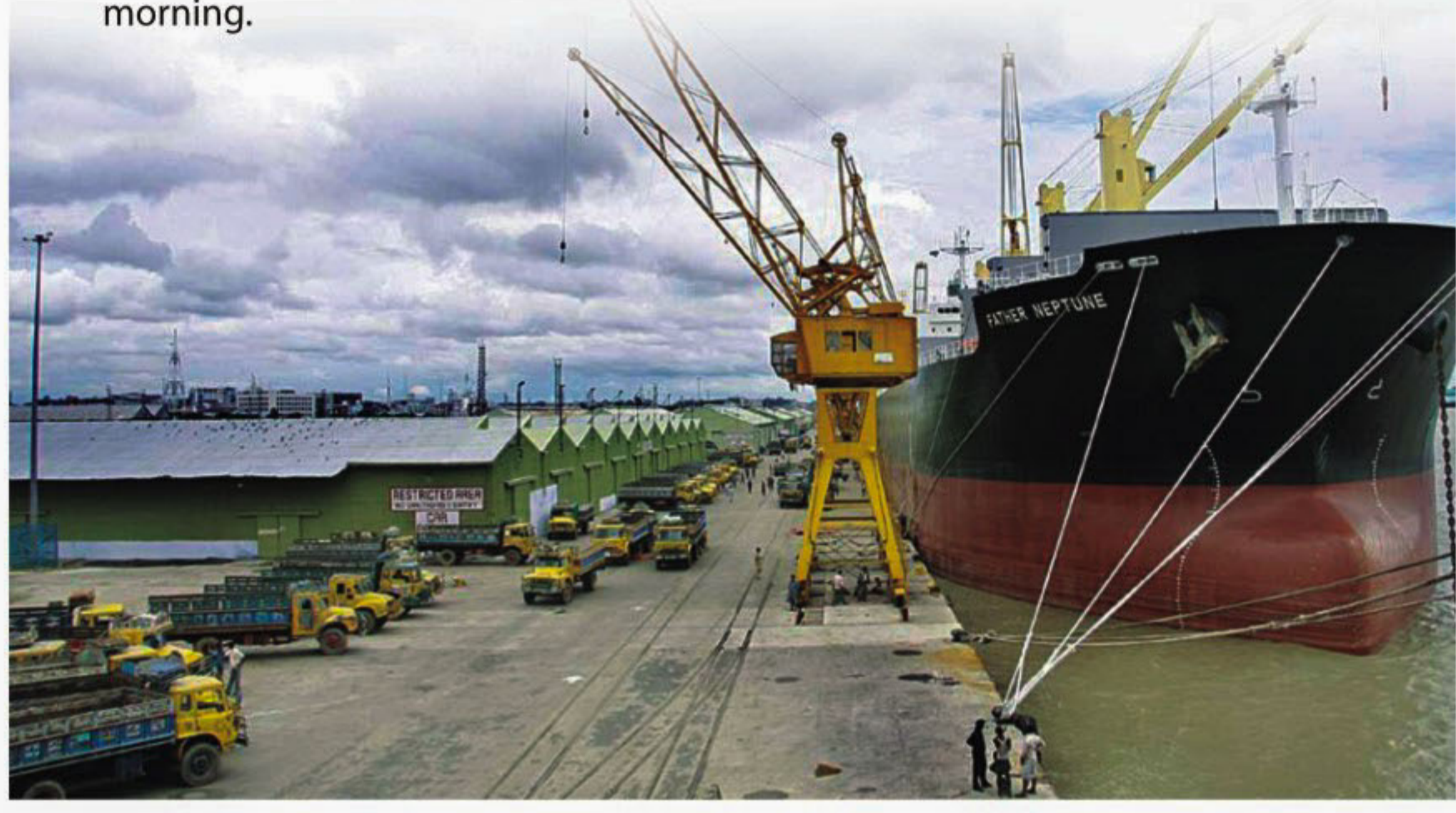
Let's meet the world everyday morning with The Daily Star

With our new publishing facility in Chittagong, our readers of Chittagong division will get their favourite English newspaper with the first light of morning.