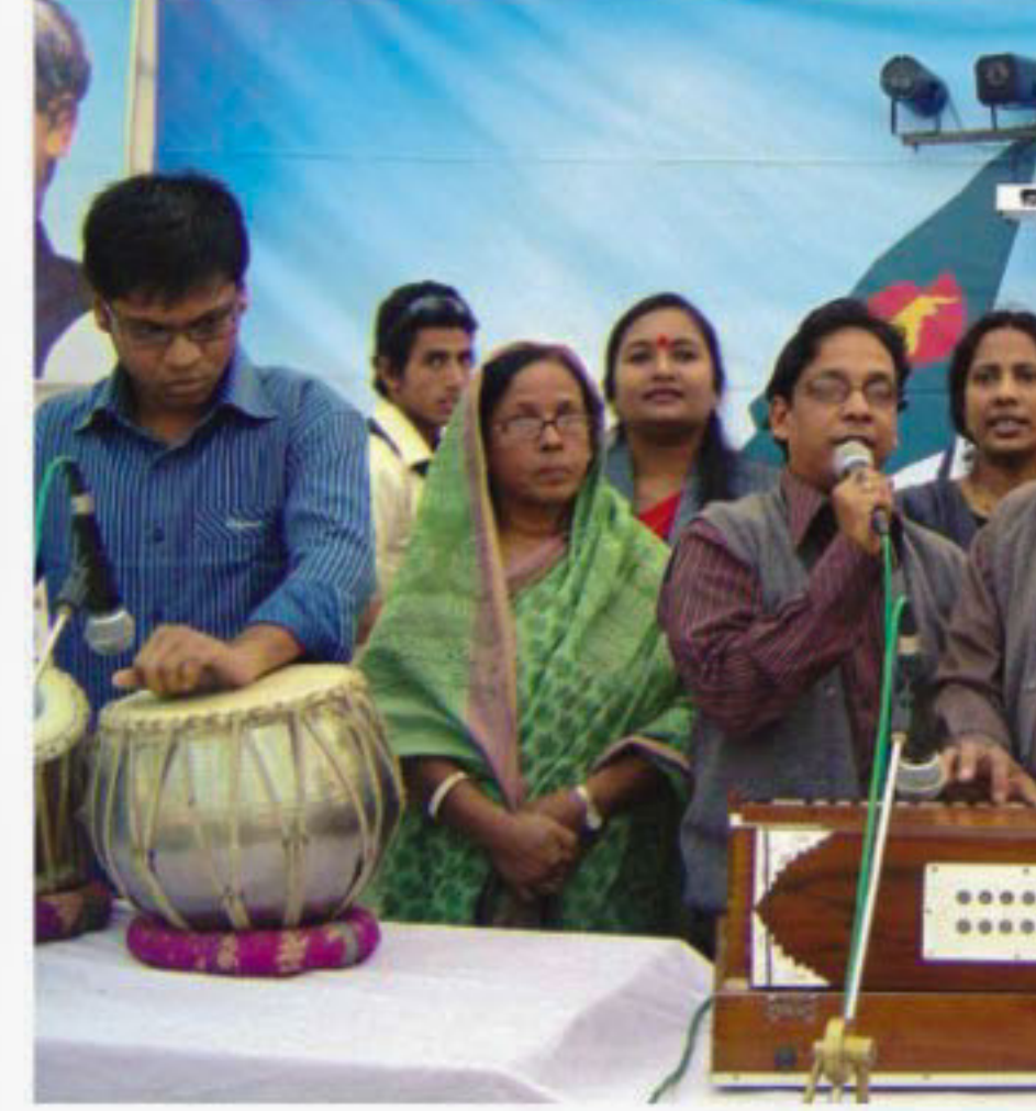
A group performance at the programme.