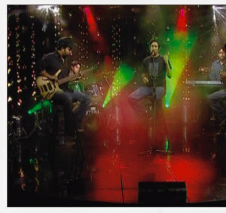
Shironamhin performs on the show.

To celebrate the Victory Day, ntv will air a special band musical programme titled "Jonmo Bhumir Gaan". Featuring popular and upcoming bands, the programme will be aired tomorrow at 1:25pm.