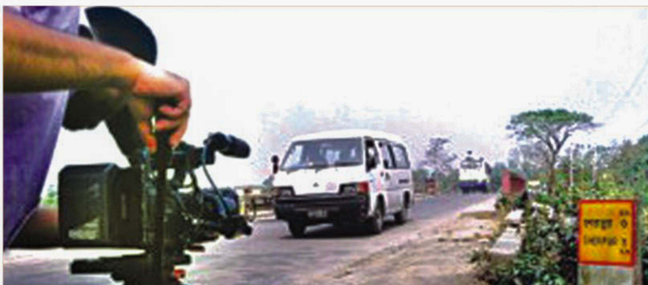
A scene from the documentary.