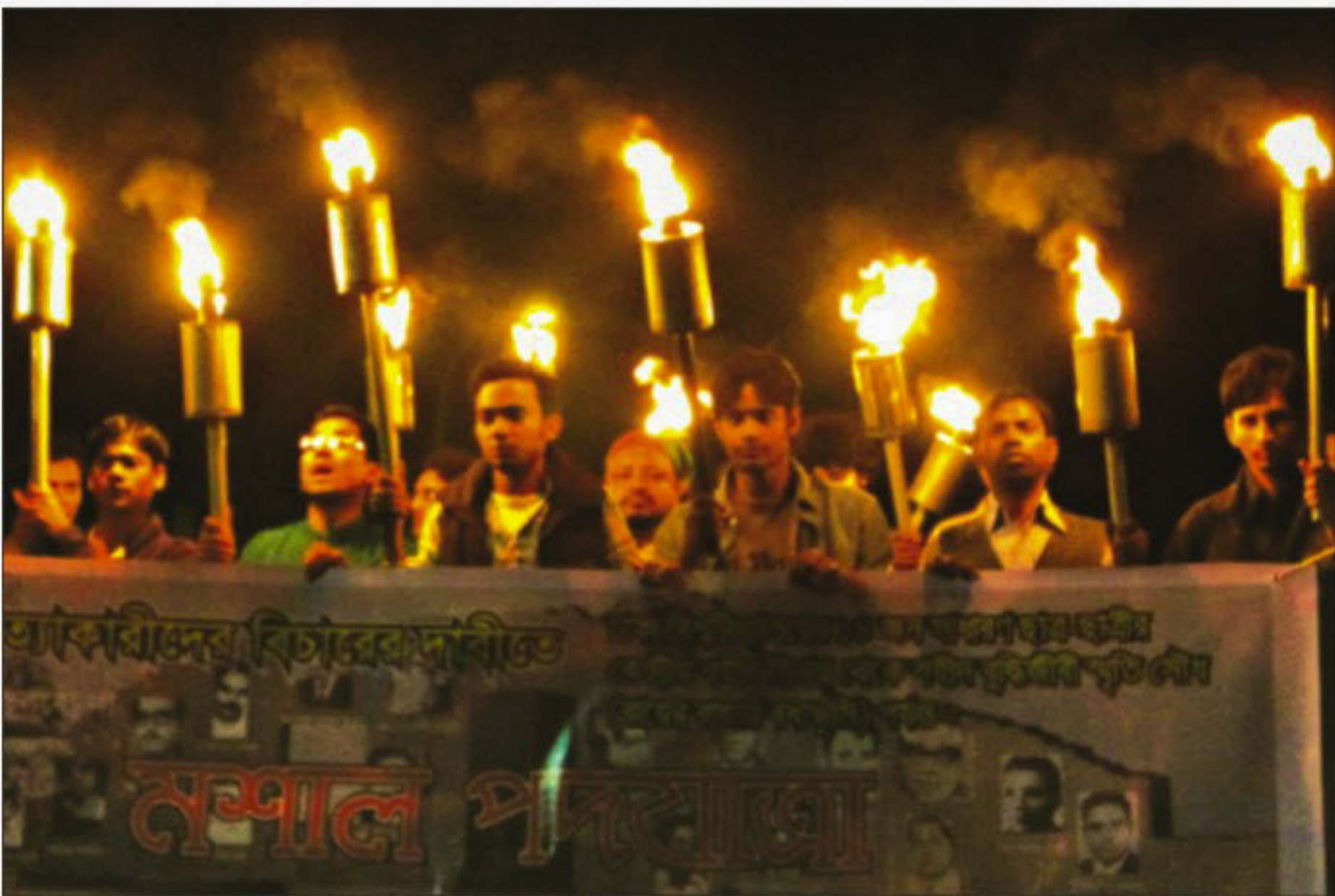
Fourteen students of Dhaka University bring out a procession carrying torches from Central Shaheed Minar to Martyred Intellectuals Memorial at Rayerbazar in the city yesterday demanding trial of the killers of intellectuals.