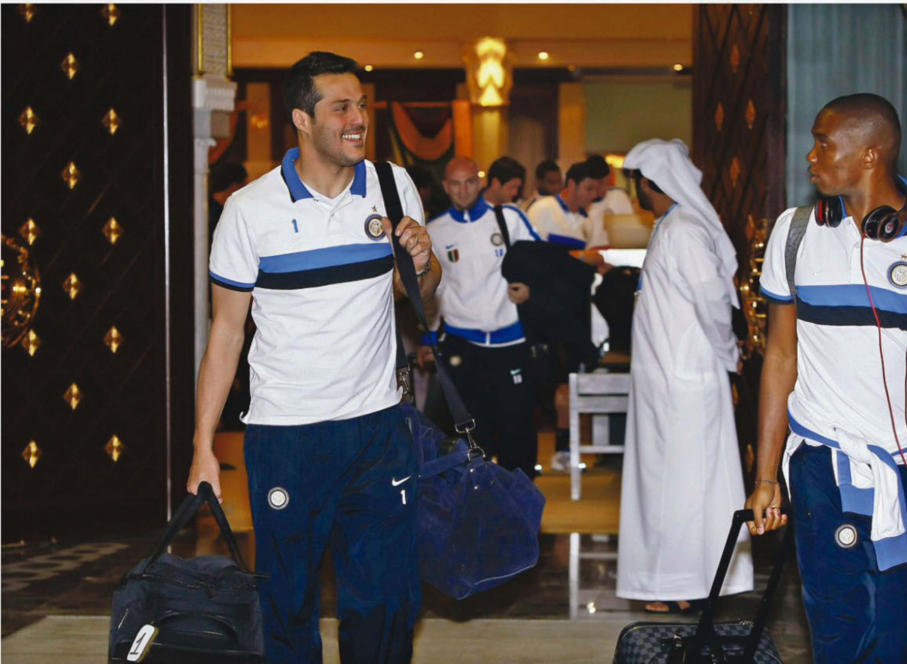
Inter Milan goalkeeper Julio Cesar (L) walks with teammate Samuel Eto'o (R) upon their arrival in Abu Dhabi on Friday to take part in the Club World Cup.