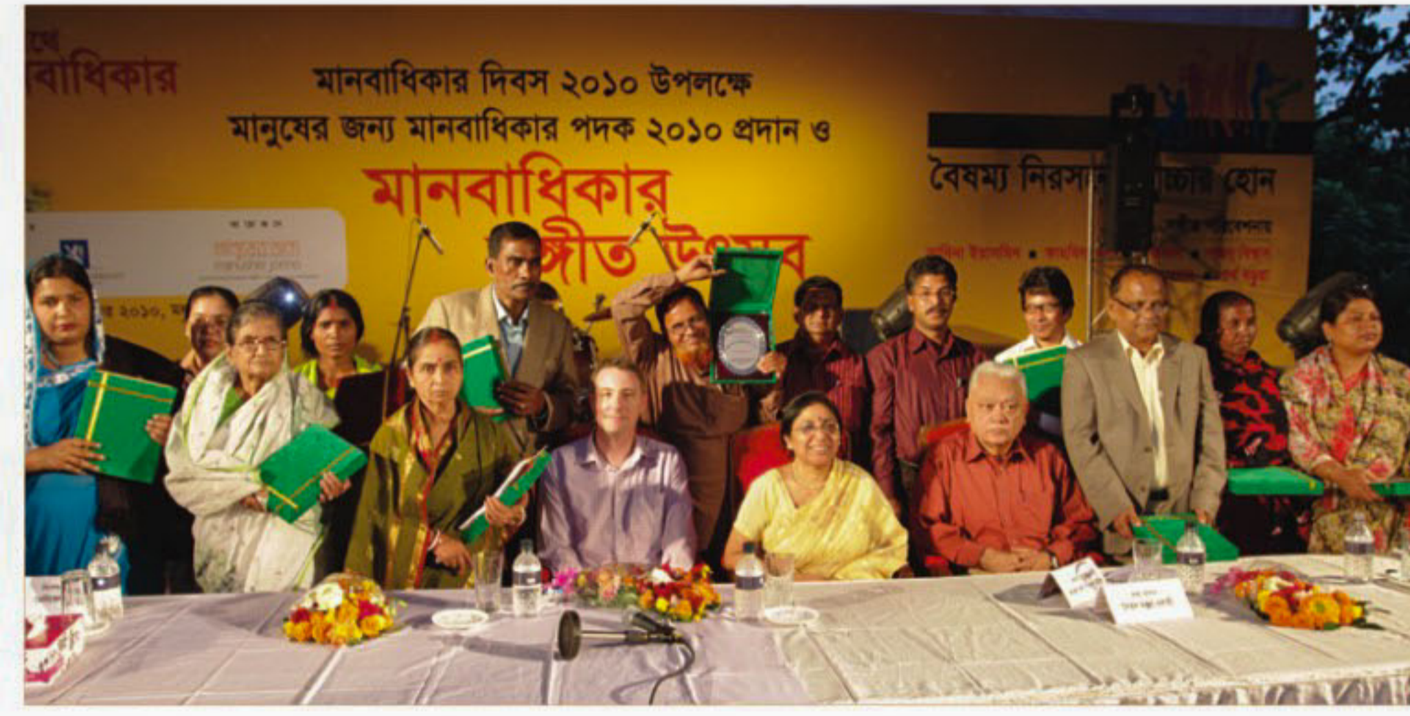
Awardees with the organisers and dignitaries (centre) at the programme.