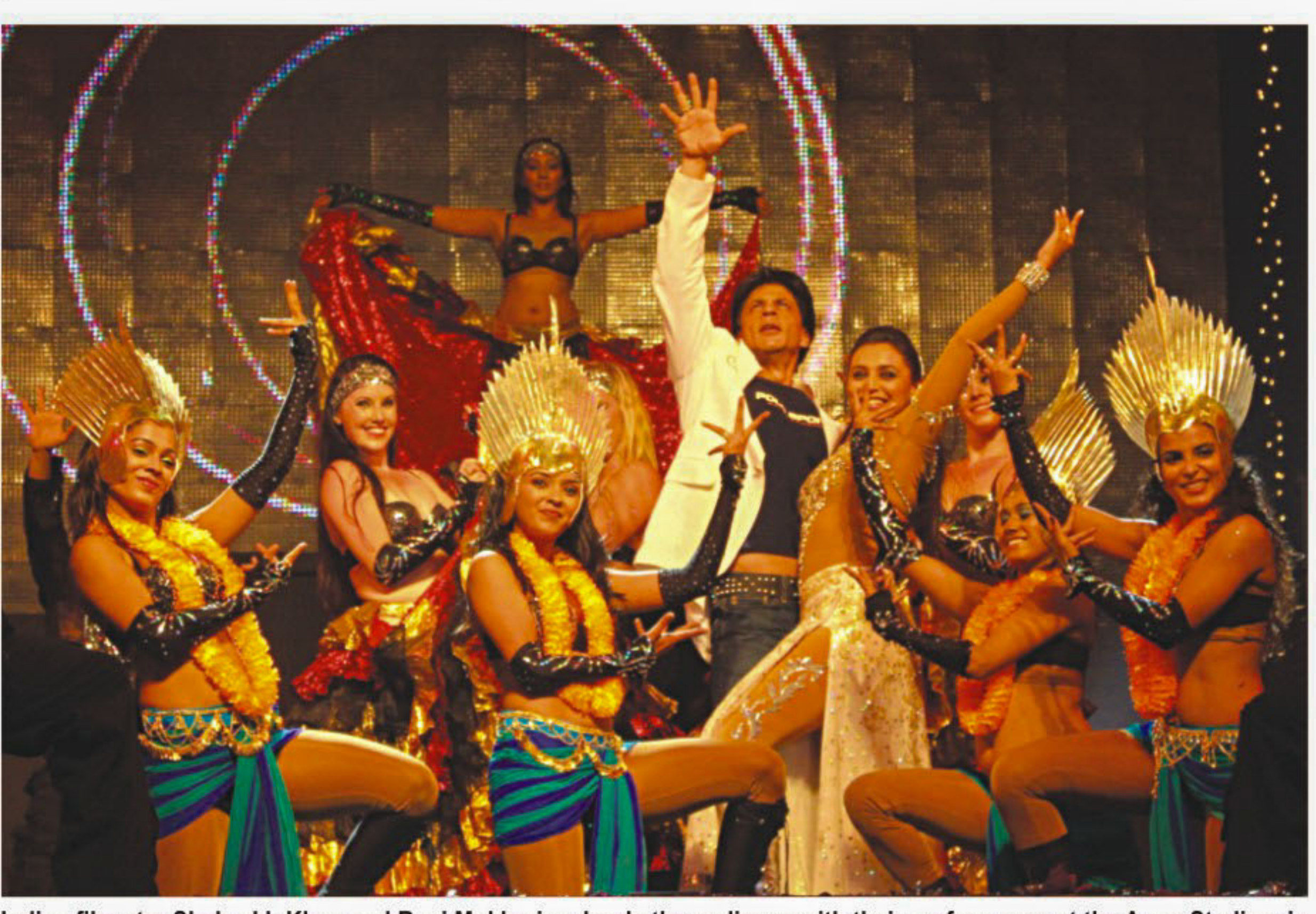
Indian film star Shahrukh Khan and Rani Mukherjee dazzle the audience with their performance at the Army Stadium in Dhaka last night.