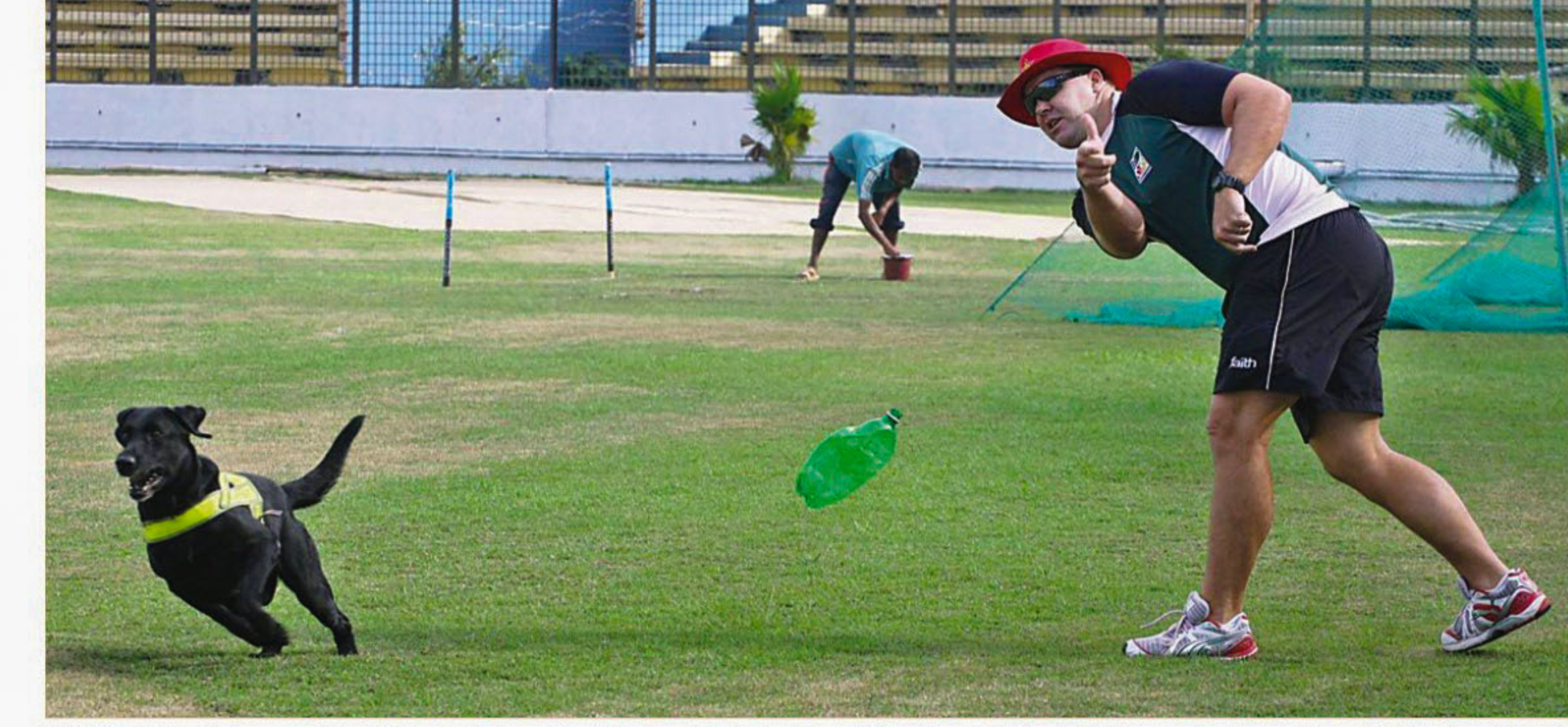
THE CHASE: Zimbabwe coach Heath Streak playing with a RAB dog at the Zohur Ahmed Chowdhury Stadium in Chittagong during practice on Wednesday where the Zimbabweans will chase the series over the final two one-dayers.