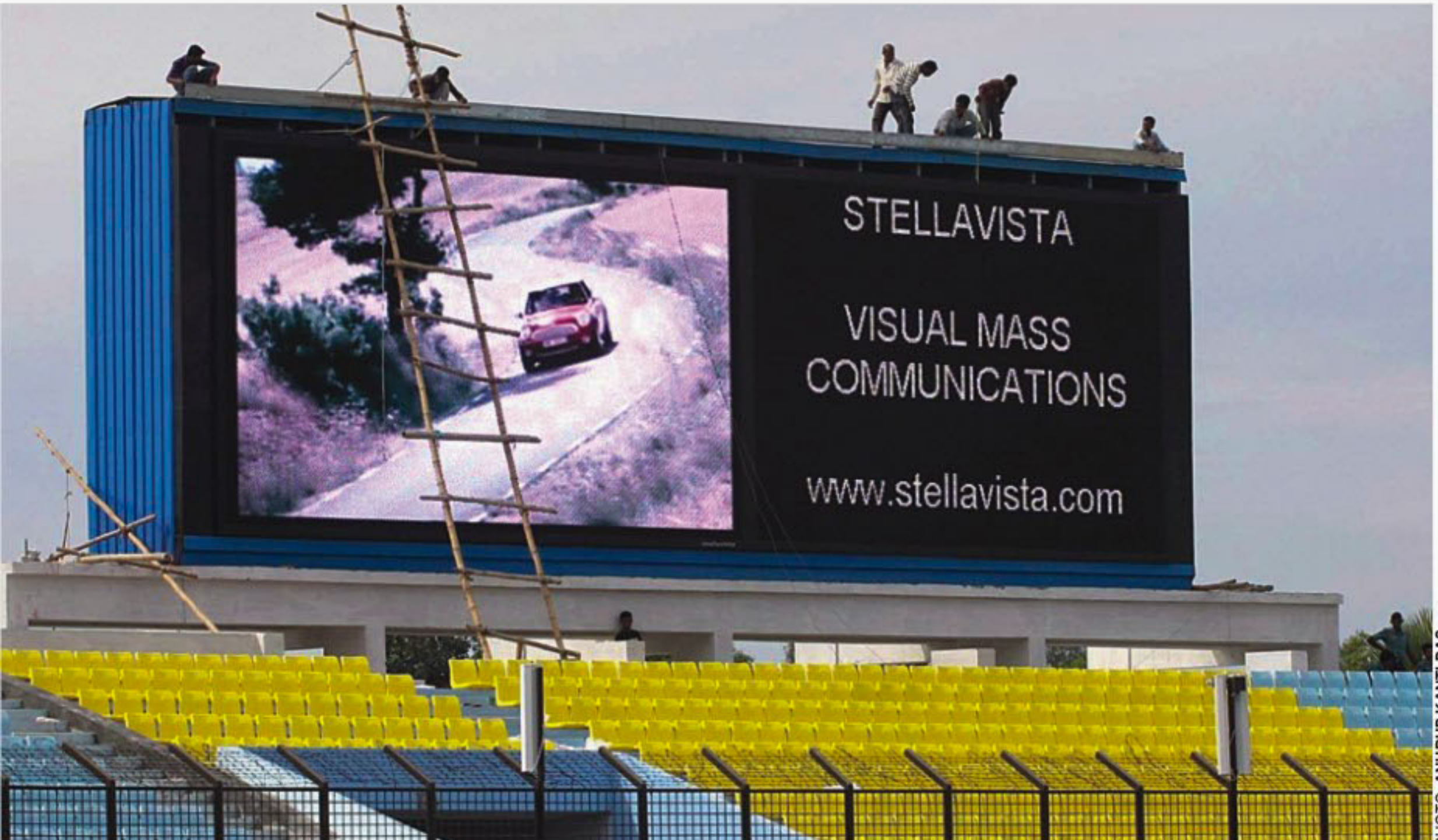
PASS THE FIRST TEST: The new giant screen, installed at the Zohur Ahmed Chowdhury Stadium in Chittagong for the World Cup, was tested on Wednesday. It will have further chance for test as it will be used in the fourth one-dayer between Bangladesh and Zimbabwe on Friday.