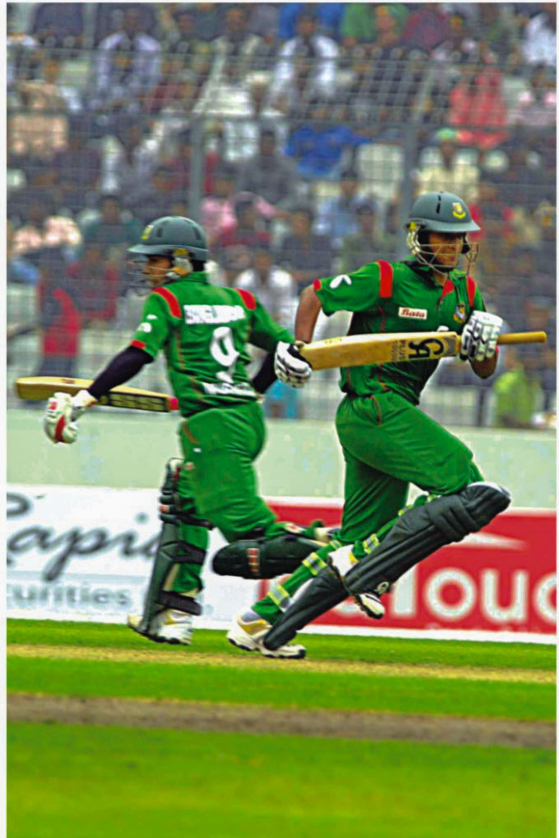
Bangladesh's Shakib Al Hasan (R) and Mushfiqur Rahim collect a single during their match-winning 116-run partnership for the fifth wicket in the third one-day international against Zimbabwe at the Sher-e-Bangla National Stadium in Mirpur yesterday.

When replying, Zimbabwe were never in the hunt as they