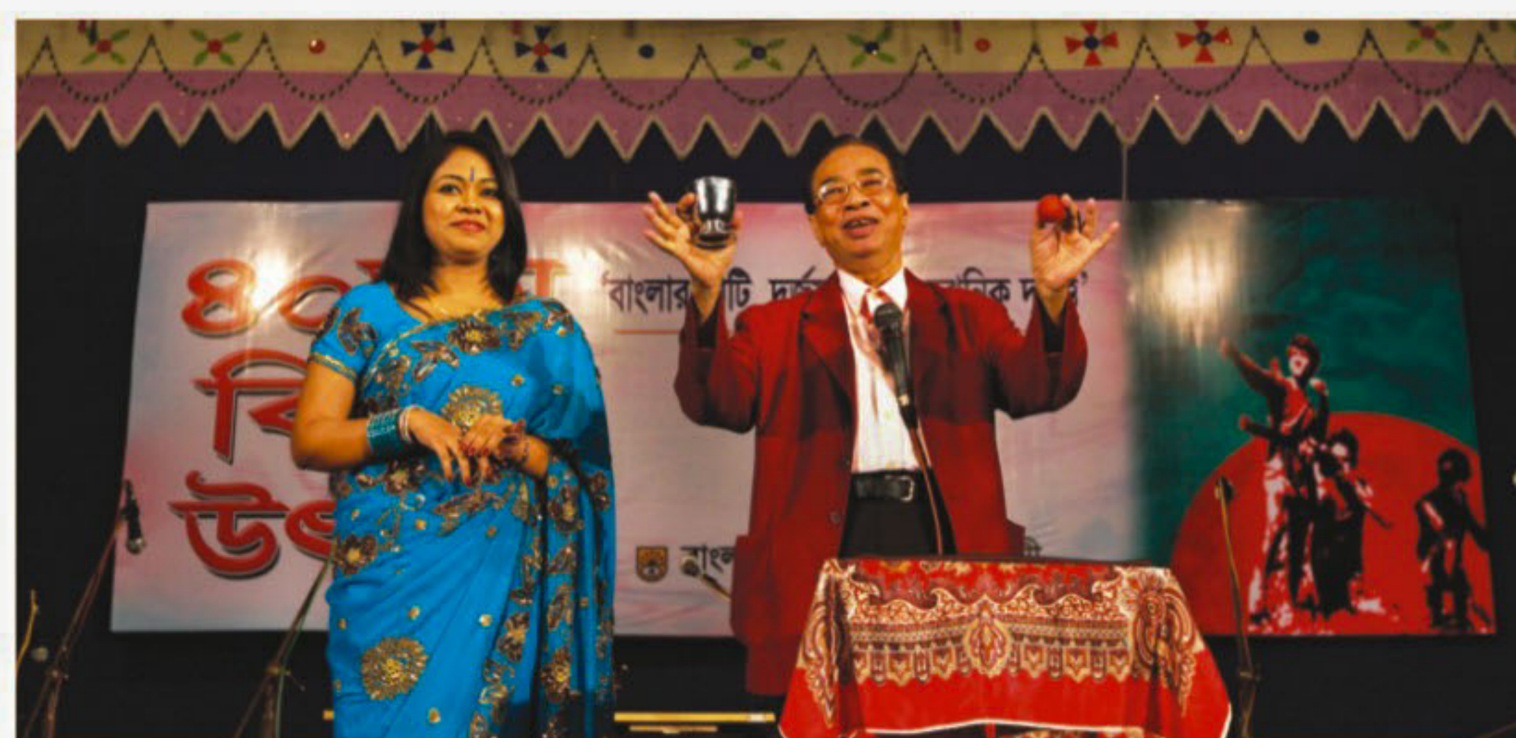
A magic act at the festival.