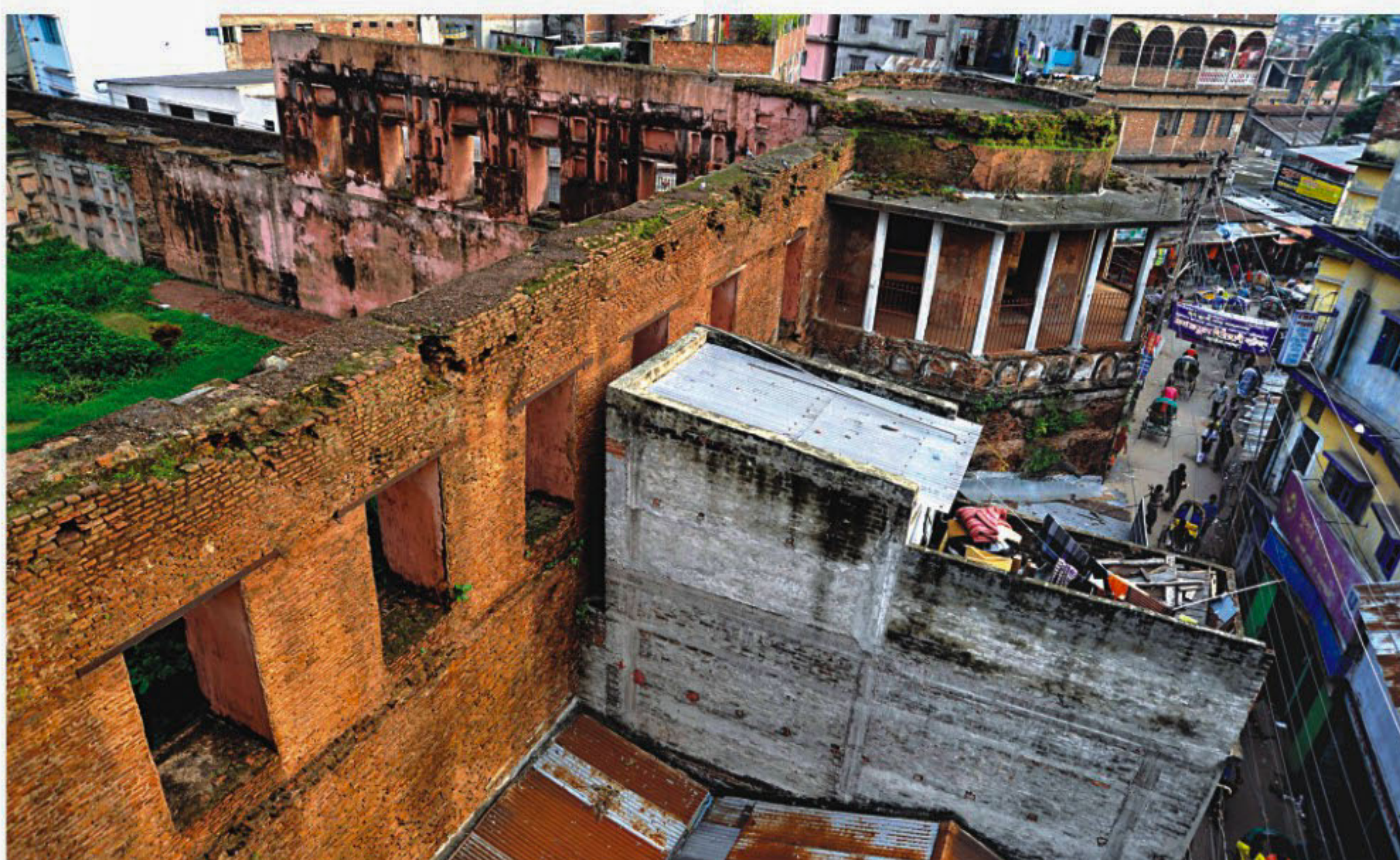
Structures stand next to the boundary wall of Lalbagh Kella, spoiling the view of the historic fort. The photo was taken recently.