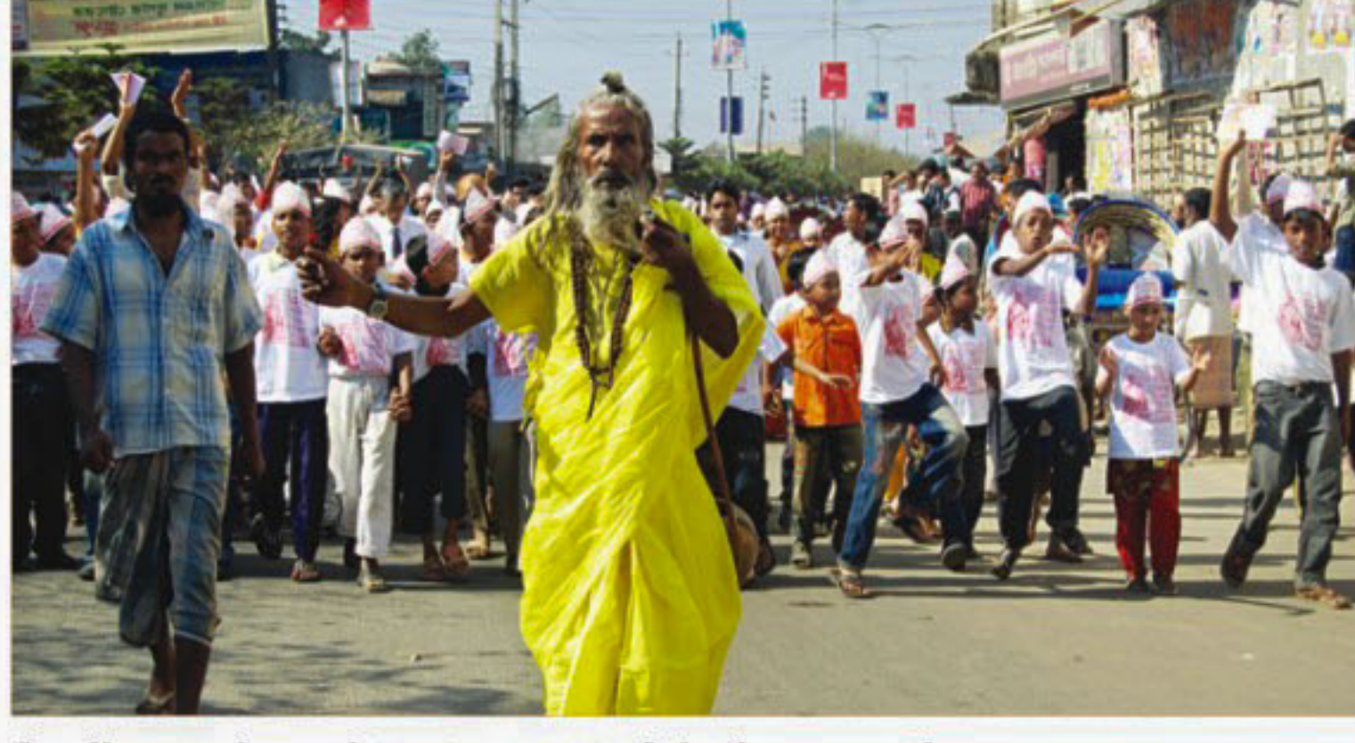
A rally was brought out as part of the inauguration.

Lalon singers from Kushtia and other districts will perform everyday as per schedule.