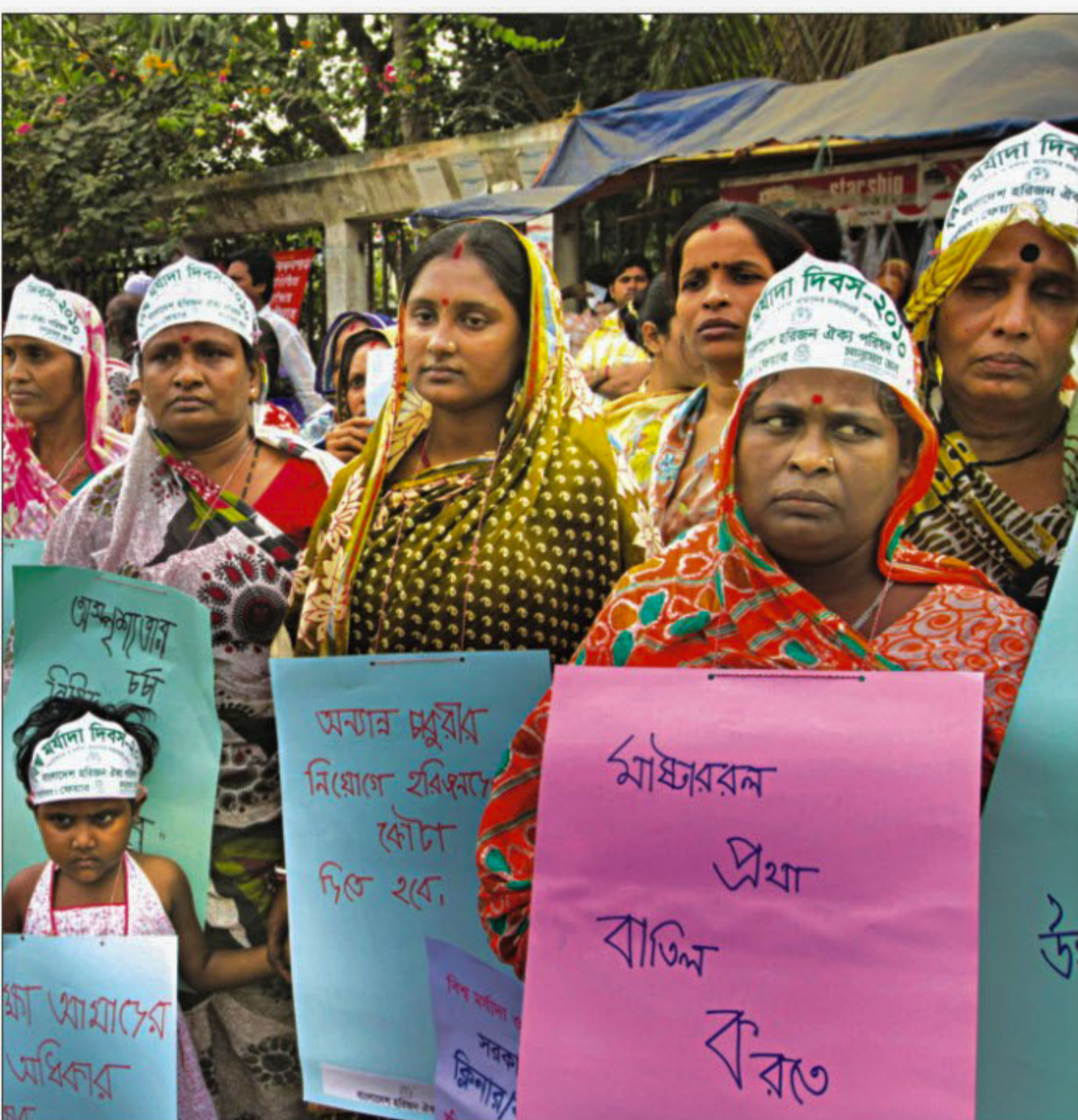
Harijan Oikya Parishad forms a human chain in front of the National Press Club in the city yesterday demanding regularisation of the job of cleaners/sweepers and a job quota at government and non-governmental organisations for the community.