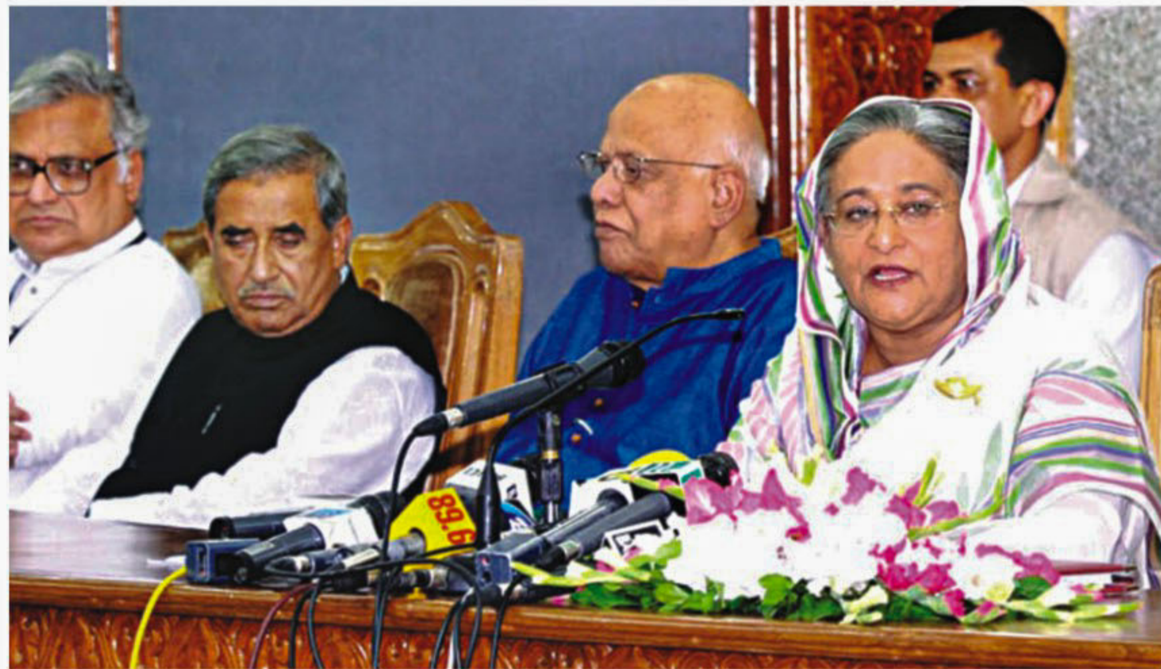
Prime Minister Sheikh Hasina addresses a press conference on her just concluded 12-day tri-nation tour of Russia, Belgium and Japan, held at PMO in the city yesterday.

Replying to a question, she said her government always invites constructive criticism from the opposition. She also questioned on the hartals being called by the opposition party.