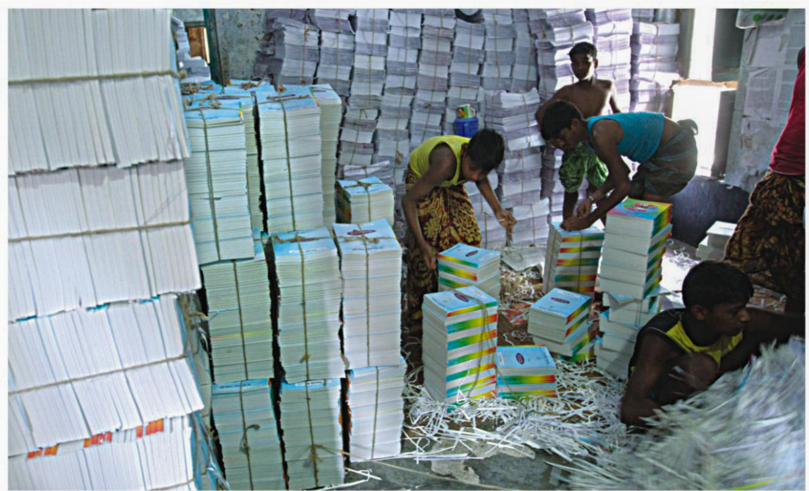
Frantic binding of books for class-I going on at a printer's factory in Bangla Bazar in the capital yesterday. The deadline for delivery of the books to the government ends on December 10.

STAFF CORRESPONDENT The country's first foreign secretary and the senior most diplomat in the Mujibnagar administration AFM Abul Fateh passed away yesterday at 7:45 in London of natural causes. SEE PAGE 6 COL 1