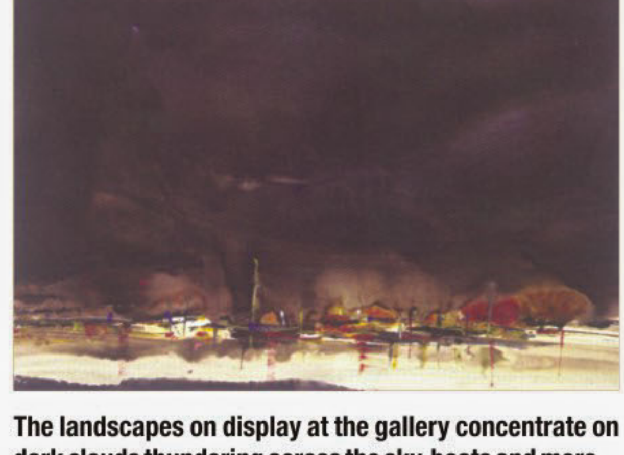
The landscapes on display at the gallery concentrate on dark clouds thundering across the sky, boats and more.

"I love to create art on a large scale, and am currently wrapping up a 32 feet stainless steel sculpture that'll be displayed at Bangladesh Bank premises. The sculpture is being installed in a public space and everyday thousands of people coming to the bank will see my work; this realisation alone makes me ecstatic. While I was working on this enormous piece, I took breaks to make watercolours and also concentrated on smaller bronze cast images," says the 2006 Ekushey Padak recipient artist who is the Chairman and Professor of the Department of Sculptures, Faculty of Fine Arts, University of Dhaka.