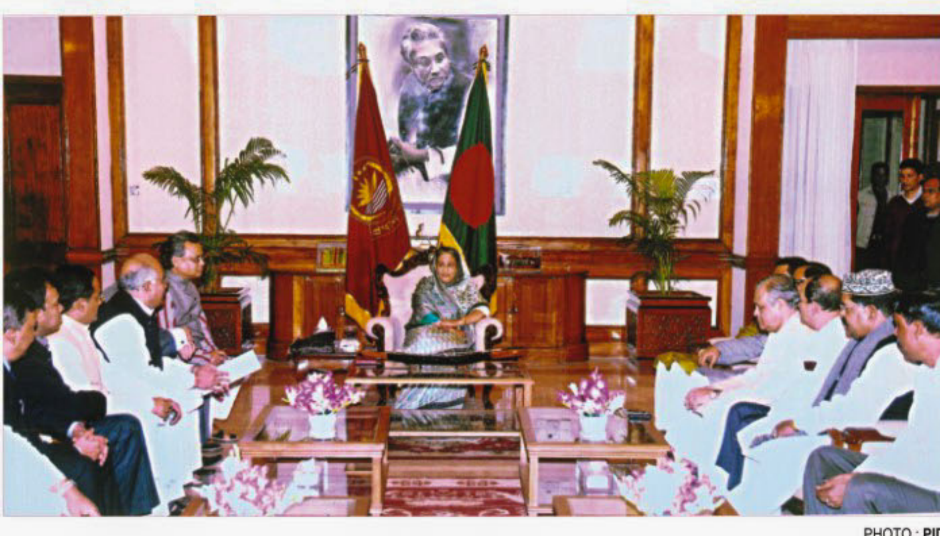
Prime Minister Sheikh Hasina exchanges view with the lawmakers of Dhaka at Gono Bhavan in the city yesterday.