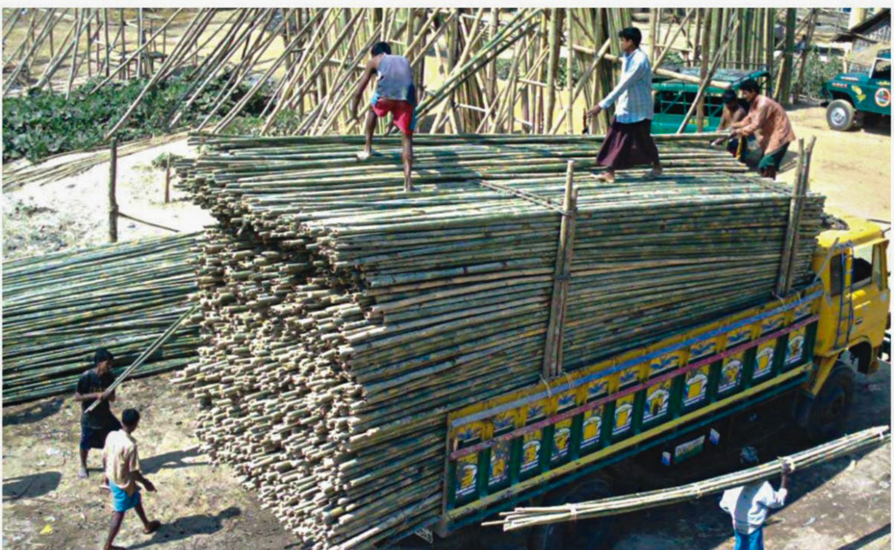
A huge stock of bamboo near the Karnaphuli Paper Mills but the factory is running at one-third its capacity, as suppliers demand high price for the raw material.