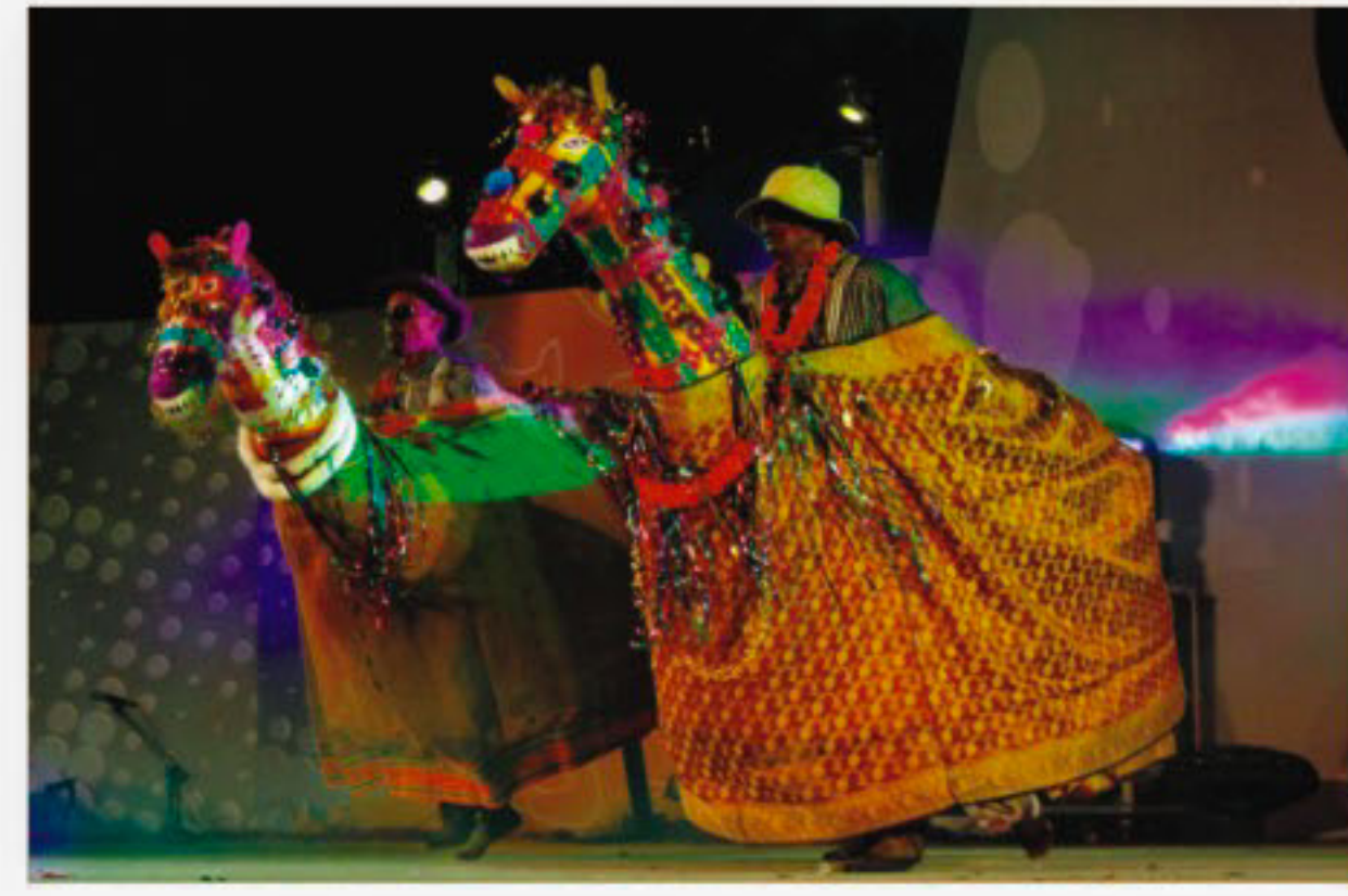
Cultural programme, an exhibition and a fair offering handicrafts and everyday items that are inseparable part of the indigenous lifestyle, are highlights of the festival.