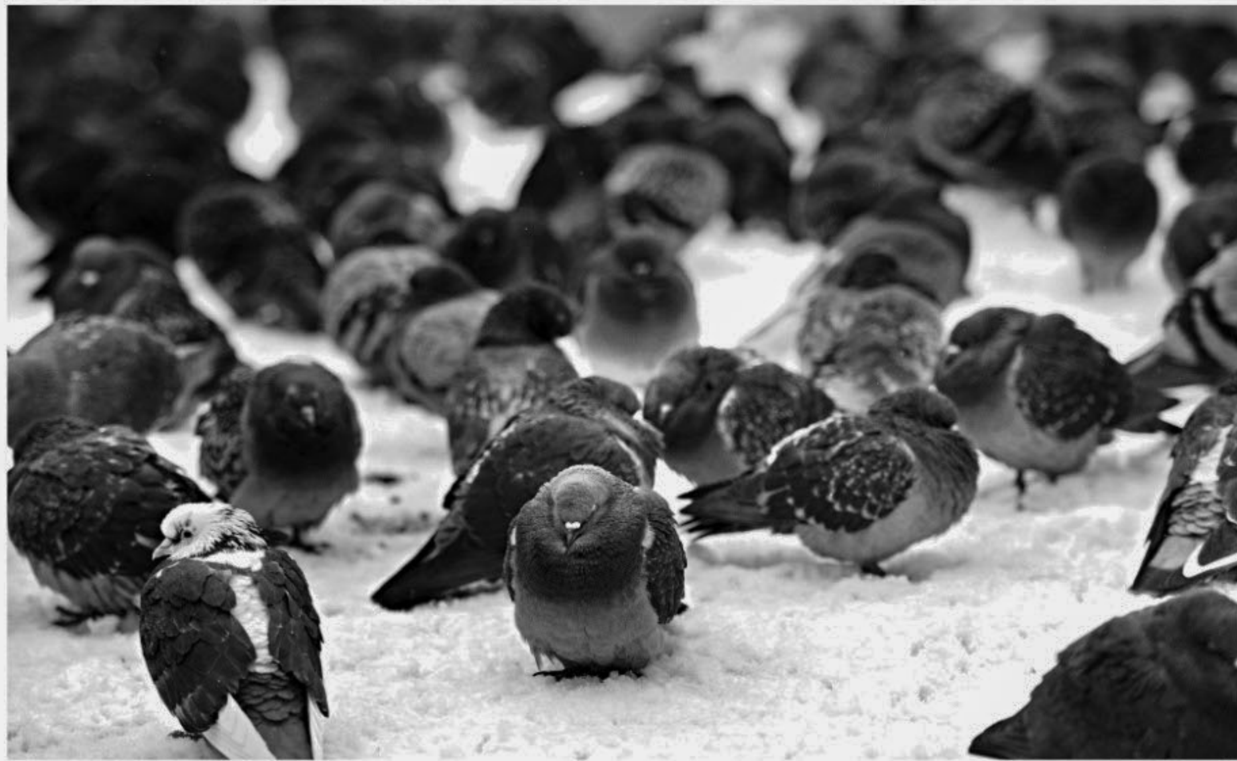
Pigeons huddle together in the snow at St James's Park in central London yesterday. Airports were shut, trains were stranded and roads were closed in Britain amid a week-long freeze that has sparked questions about why the country grinds to a halt when snow falls.

None of Wu's published remarks mentioned the recent confrontation between North and South Korea, or the long-running dispute over North Korea's nuclear activities.