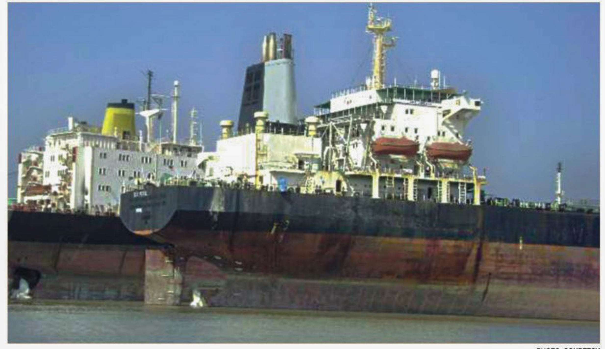
Two of the ships that were brought in through legal loopholes. The photo was taken from Sitakunda.

The 16 ship-breakers who have been granted temporary environmental clearance are not doing much to fulfil the 56 conditions on which they obtained the go-ahead, said industry insiders. The Department of Environment (DoE) has, however, expressed satisfaction over the environmental management of these ship-breaking yards although the yards are not properly equipped to handle toxic substance used in ships. The DoE environmental management committee in its 288th meeting on October 18, 19 and 21 made the decision although the law does not allow any environmental clearance on a temporary basis for such hazardous sectors. Besides, some of the conditions given to the 16 ship-breakers are contradictory to the High Court order passed in March last year. SEE PAGE 7 COL 7