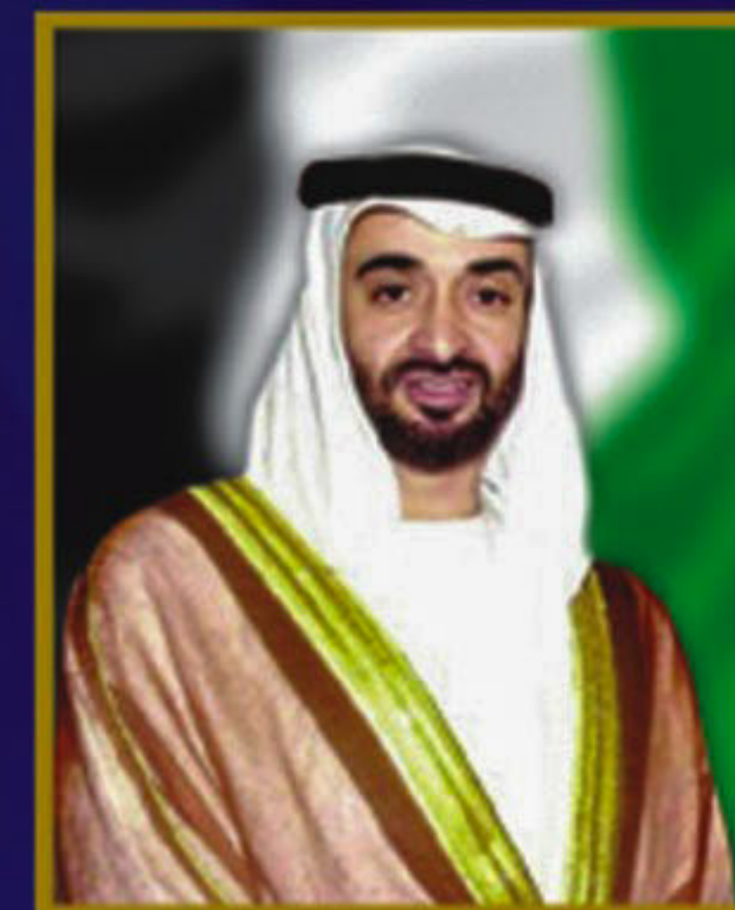
H. H. Sheikh Mohammed Bin Zayed Al Nahyan Crown Prince of Abu Dhabi

WE EXTEND OUR HEARTIEST FELICITATIONS TO THE LEADERSHIP OF UNITED ARAB EMIRATES AND ITS CITIZENS ON THEIR 39 TH NATIONAL DAY