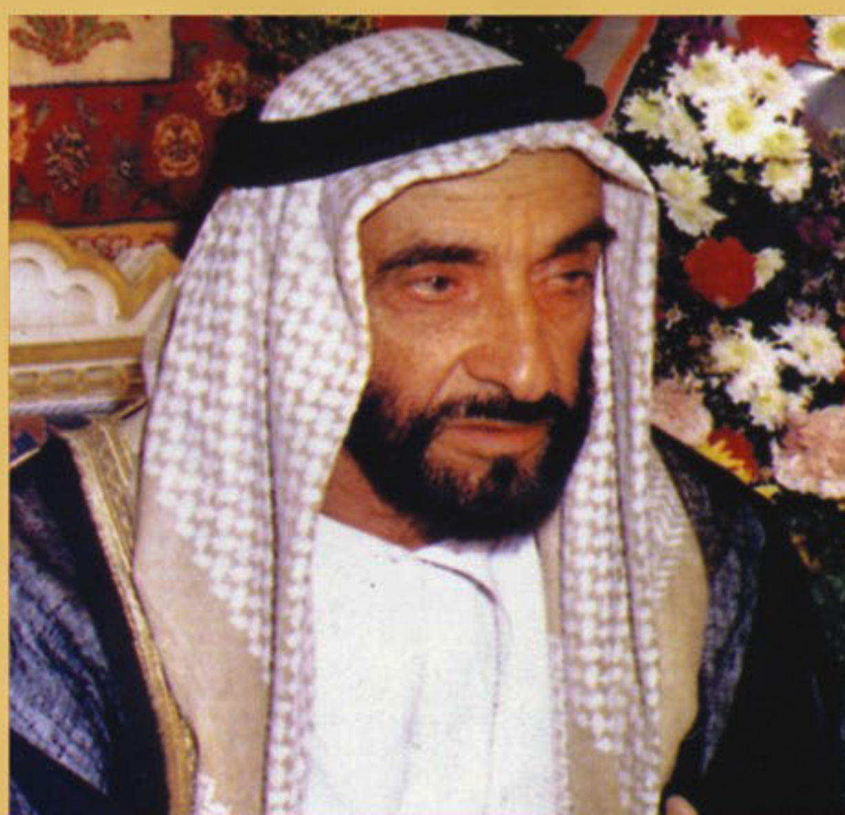
Founder President of the United Arab Emirates Late His Highness Sheikh Zayed Bin Sultan Al Nahyan