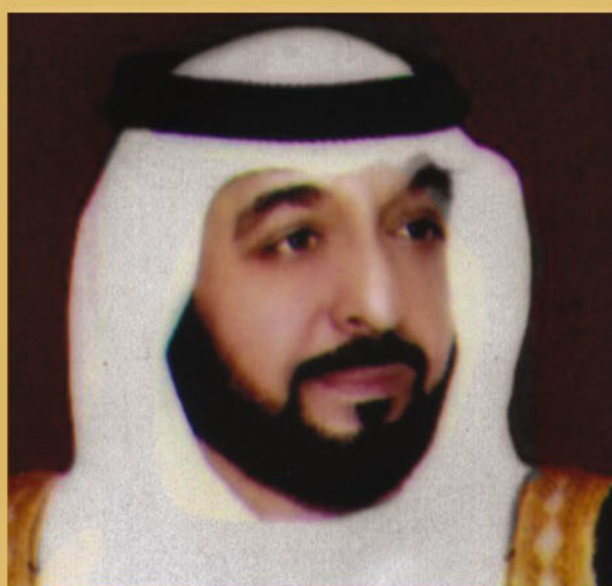
His Highness Sheikh Khalifa Bin Zayed Al Nahyan President of the United Arab Emirates