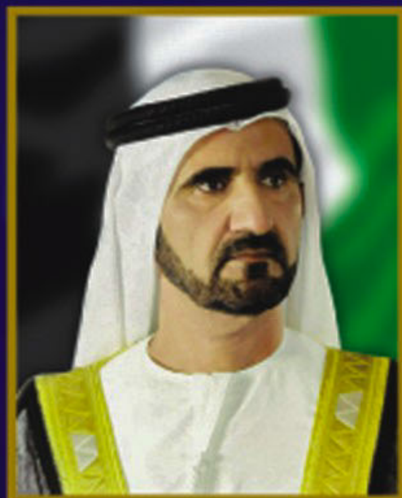
H. H. Sheikh Mohammed Bin Rashid Al Maktoum U.A.E. Vice President, Prime Minister and the Ruler of Dubai