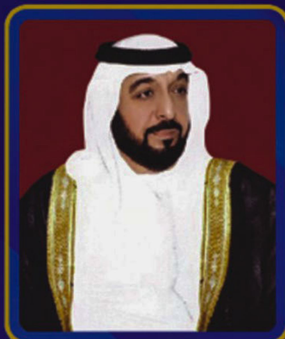
His Highness Sheikh Khalifa Bin Zayed Al Nahyan President of U.A.E.