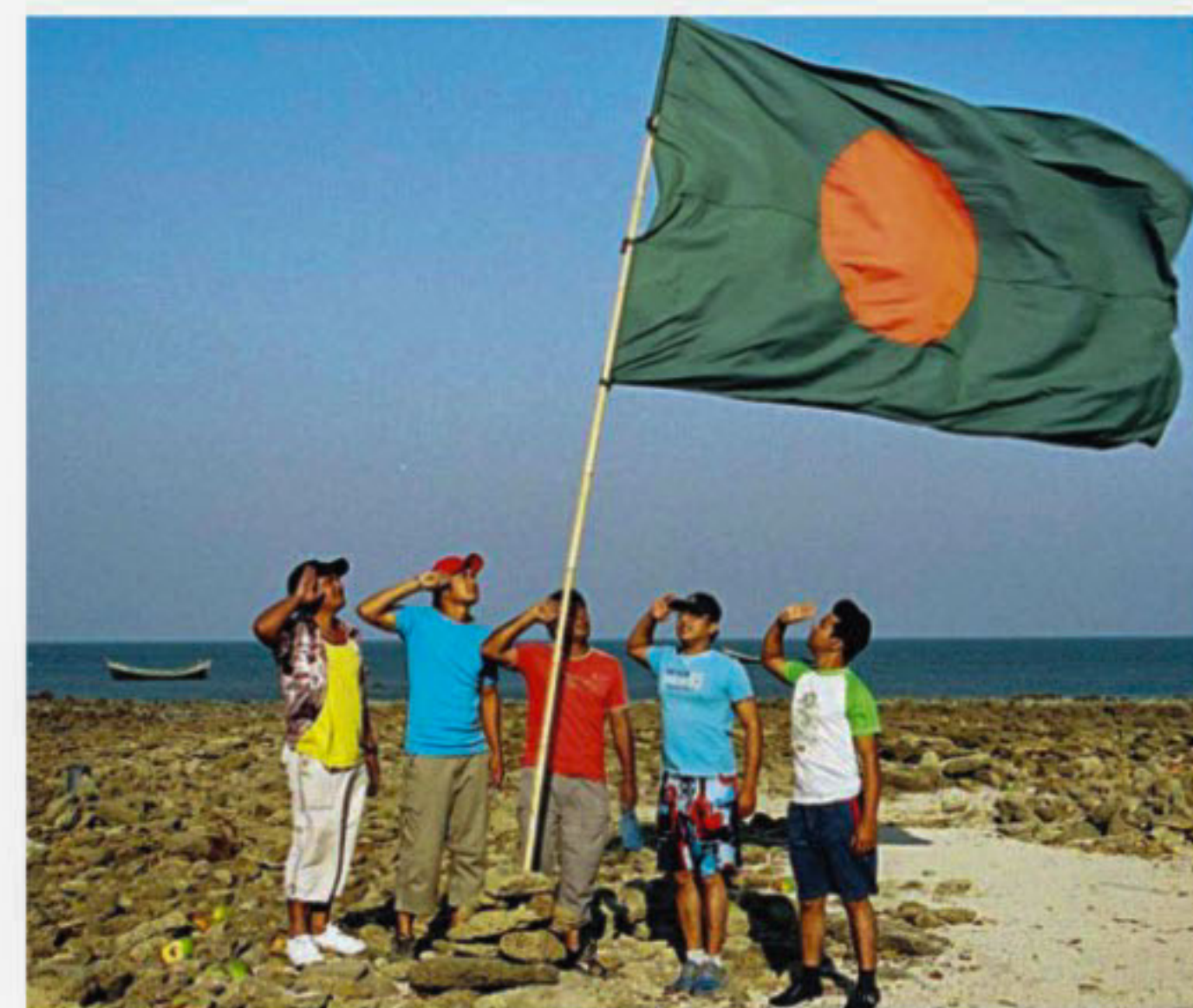
A scene from the film.

Organisers of the Bali Festival announced the award on November 27 which will be officially handed over soon.