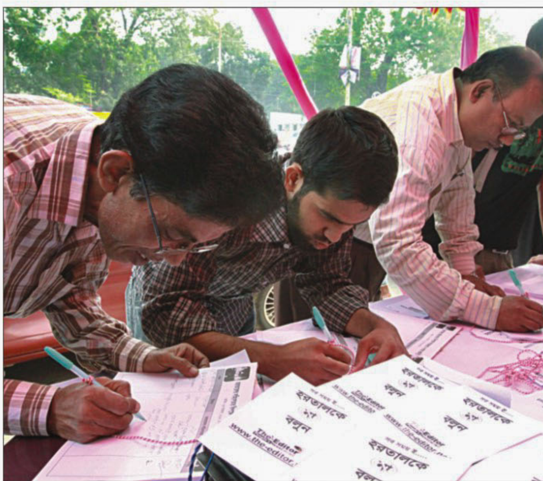
The Editor, an online newspaper, launches a campaign in front of the National Museum in the city yesterday to collect signatures of people against hartal.