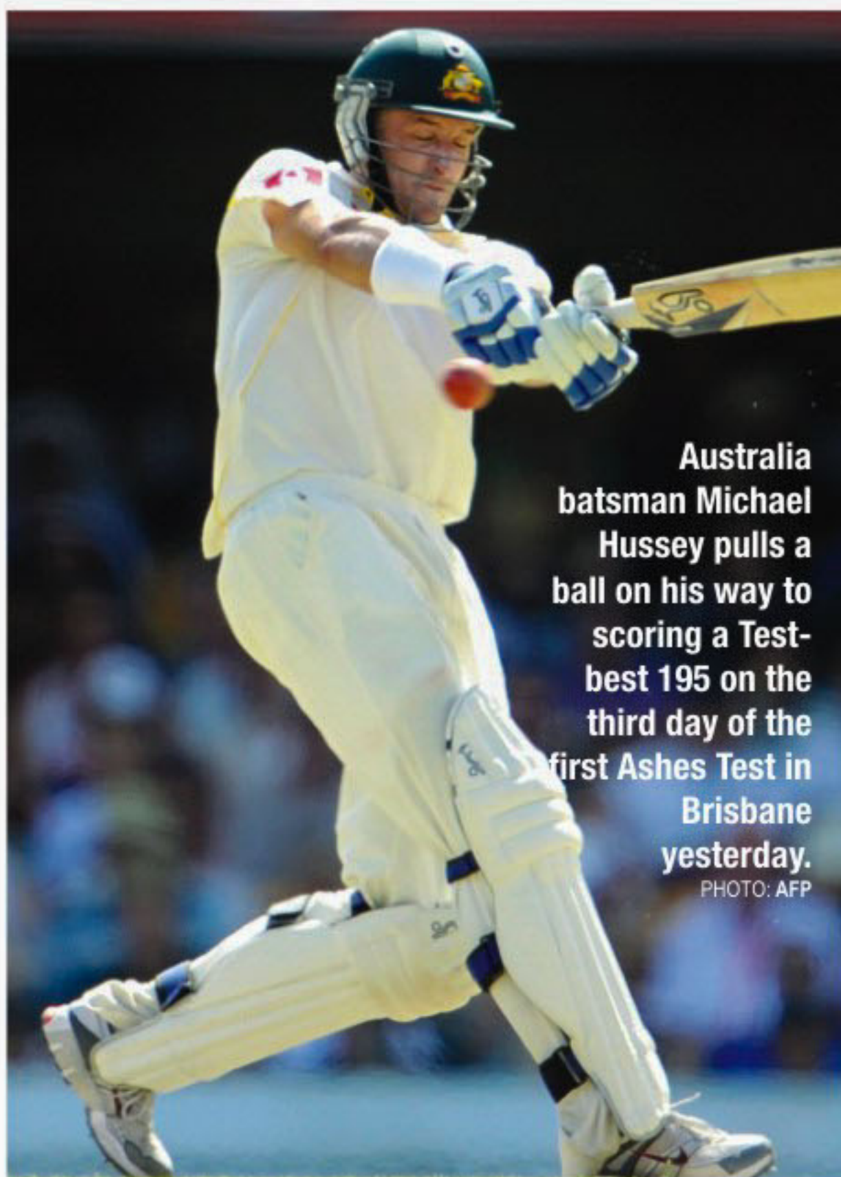
Australia batsman Michael Hussey pulls a ball on his way to scoring a Test-best 195 on the third day of the first Ashes Test in Brisbane yesterday.