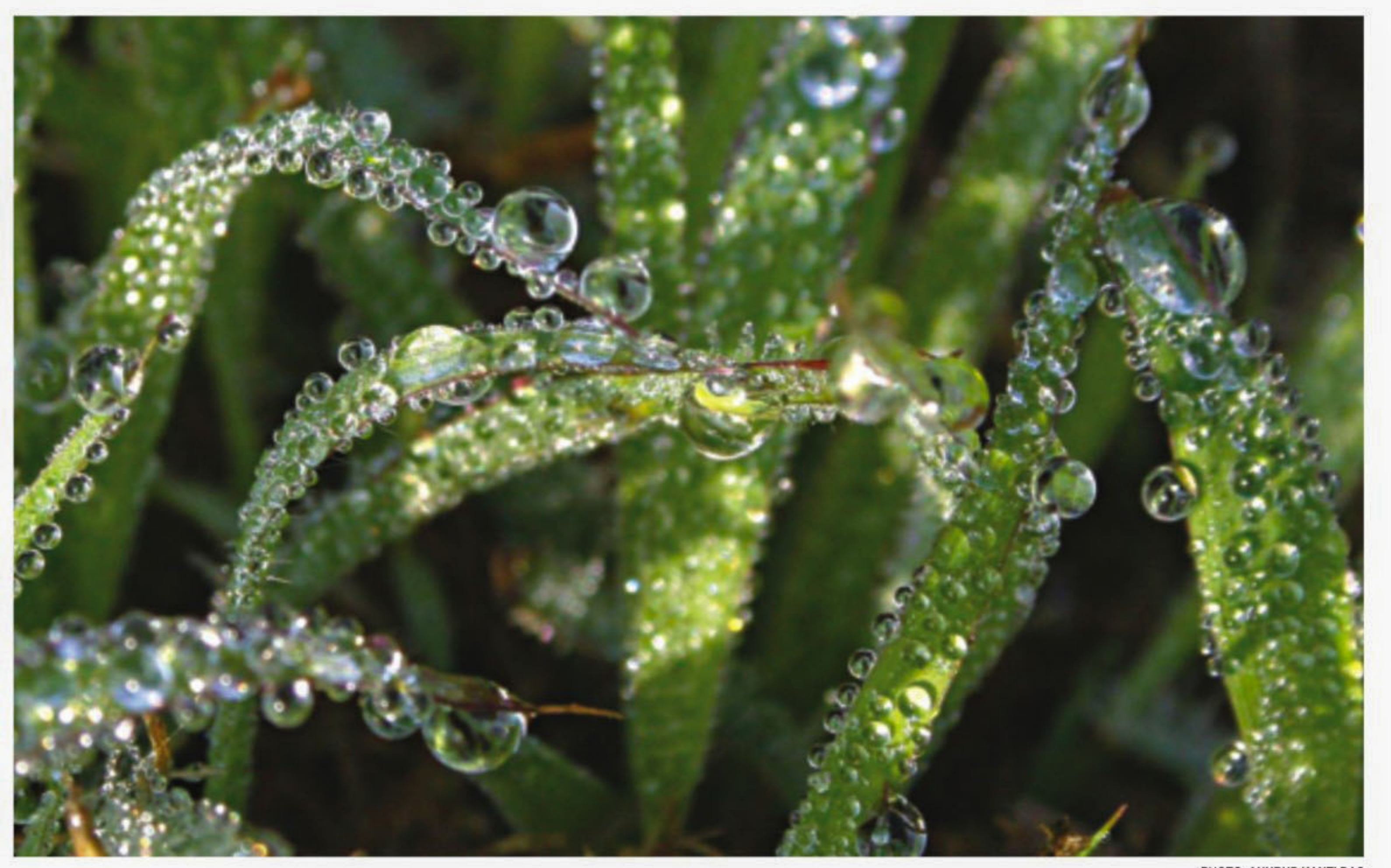
Morning dew on blades of grass as if they are dressed in diamonds. The photo was taken at Zahur Ahmed Chowdhury Stadium in Chittagong.

Obama plays Basketball, gets hurt REUTERS, Washington US President Barack Obama was accidentally elbowed in the face while playing basketball on Friday and received 12 stitches to his lip, the White House said. Obama, a keen basketball player, had been playing with friends and family in a SEE PAGE 15 COL 7