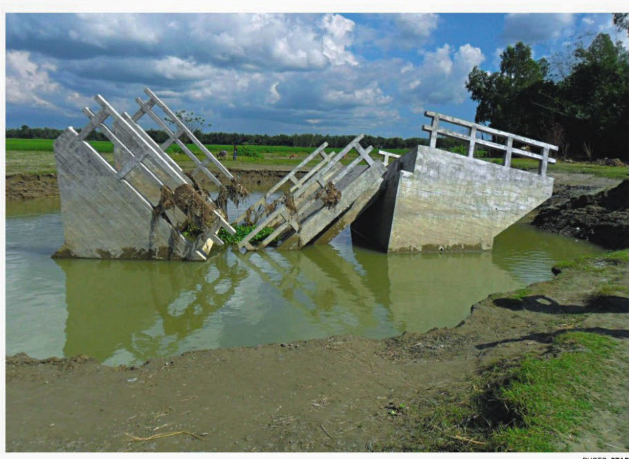
A recent photograph shows the bridge at Kolkihara of Rajibpur in Kurigram broken in the middle.

ABDUL WAHED, Kurigram About 15 thousand people of ten villages of Mohanganj union under Rajibpur upazil are facing problems while going to the upazila headquarters as Kolkihara Bridge on Mohanganj-Rajibpur road collapsed, only three months after its construction. "We have to walk a long way as no vehicles ply the road because of the broken bridge. We have to use alternative road to reach upazila headquarters," said Joyen Uddin of Kolkihara village. Construction work of the 33-feet-long and 14-feet-wide bridge across the dying river Kolkihara started in January this year and completed in June, said locals. Ministry of Relief and Rehabilitation arranged the construction of the bridge at a cost of Tk 18.65 lakh. The bridge partially collapsed within a month after construction as floodwater hit the area. It fully collapsed in September due to the second phase of flood. The second flood washed away soil from the approach roads on both sides of the bridge, said Ali Akbar, a villager. Locals alleged that the contractor did not properly fill up the approach sections of the bridge with soil. Even a ditch beside the bridge was not filled up. However, contractor Mahabubur Rahman claimed that the construction work of the bridge was completed as per schedule. But due to heavy rain and early floods, they could not fill up the SEE PAGE 15 COL 6