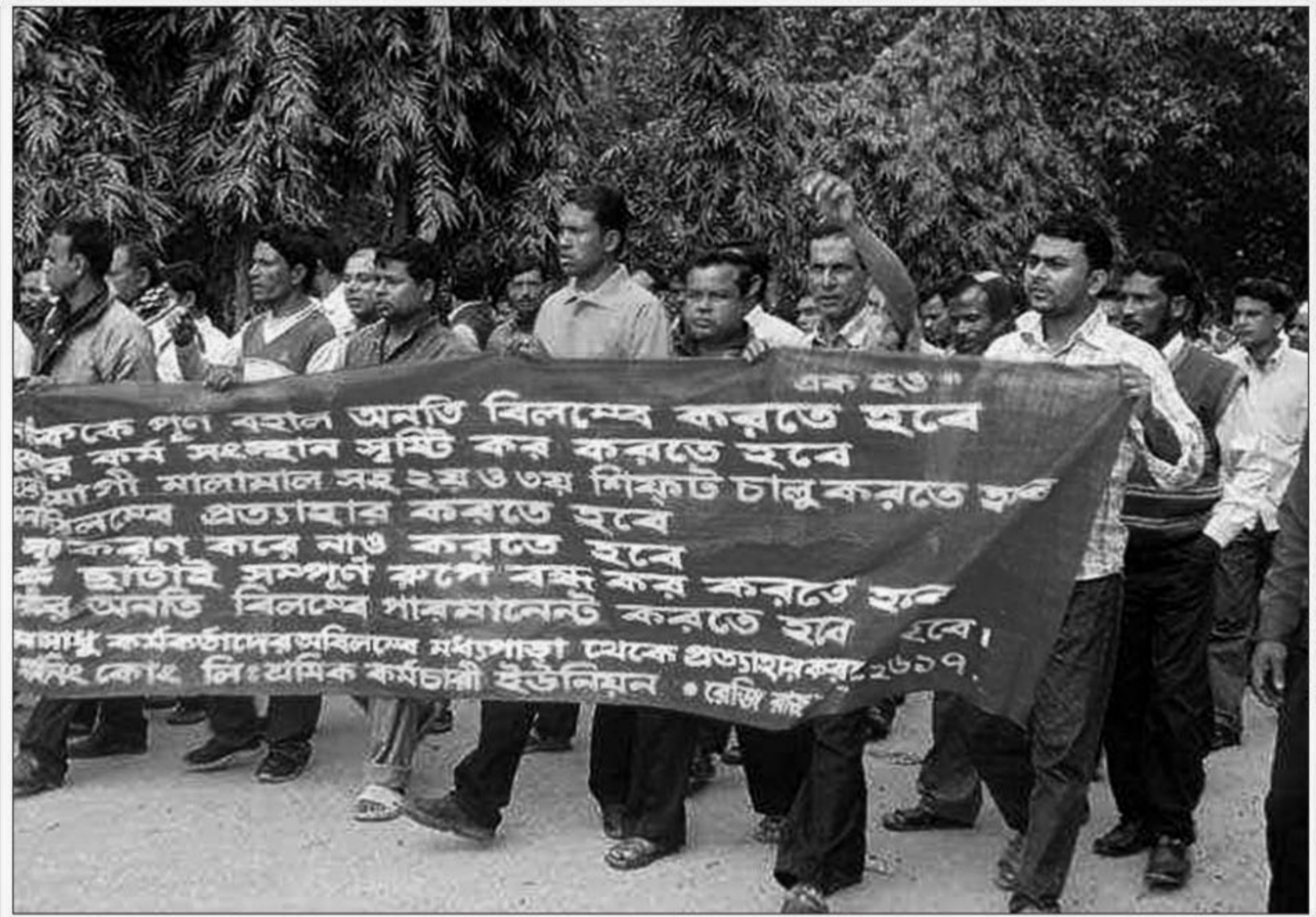
Miners of Madhyapara Granite Mining Company Ltd stage demonstration in front of the main entrance yesterday protesting termination of five fellows and demanding withdrawal of the case filed against them by the authorities. Story on page 16