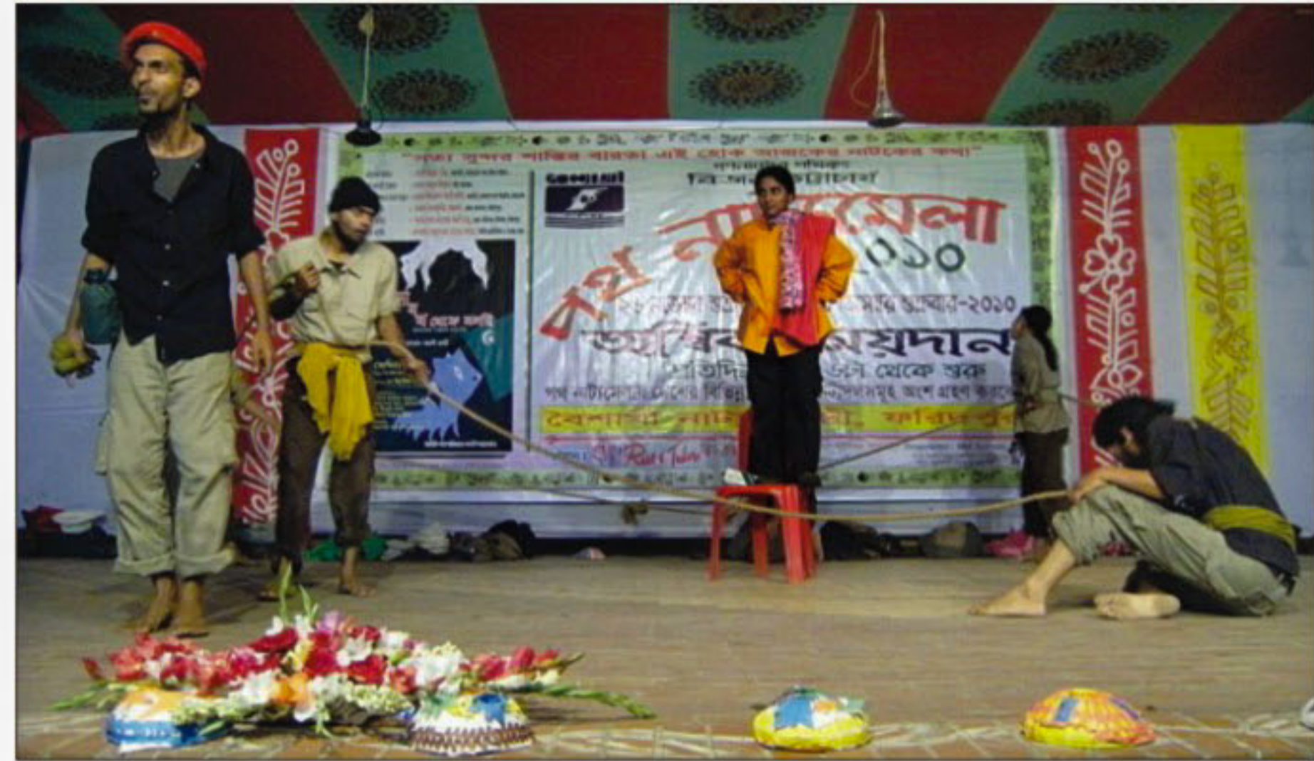
Around 20 troupes participate at the programme.