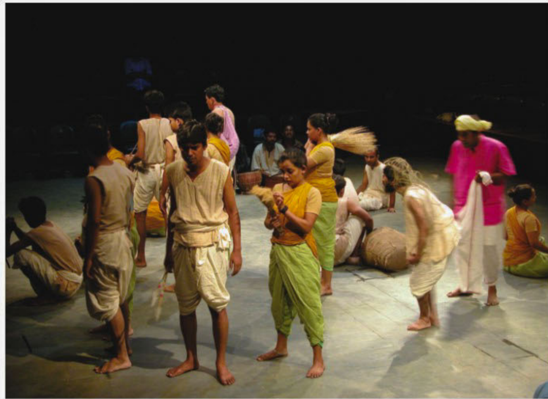
The first day, noted troupe Aranyak Natyadal staged its acclaimed production "Raarang."