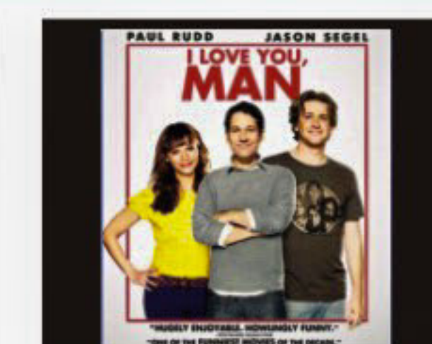
I Love You, Man On HBO at 09:30pm Genre: Comedy/ Romance Cast: Paul Rudd, Jason Segel