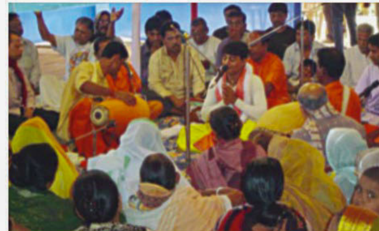
Devotees assemble at the programme.

Hundreds of Hindu devotees attended the programmes daily.