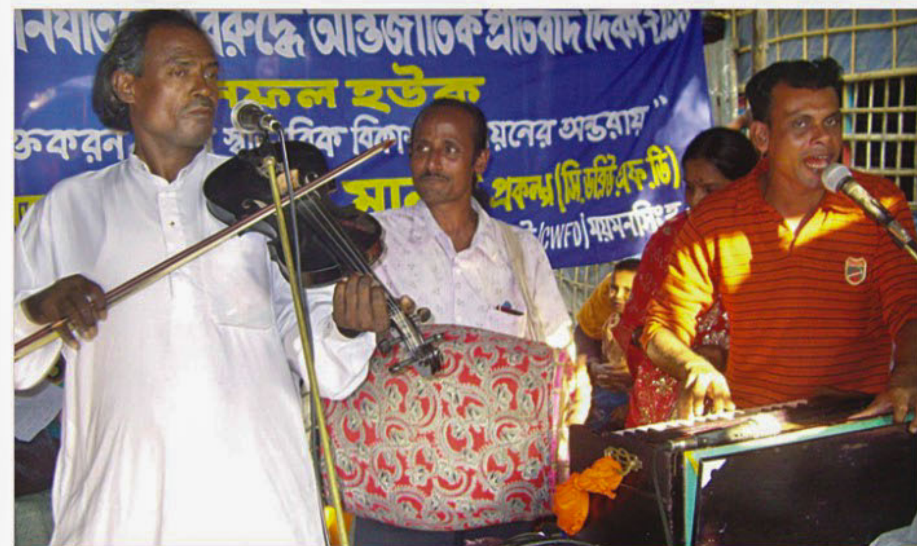
Artistes rendered Baul songs composed on the negative effects of repression of women.

In this competitive world, girls need to be educated and the state should step in to provide them with greater scope for education, the speakers concluded.